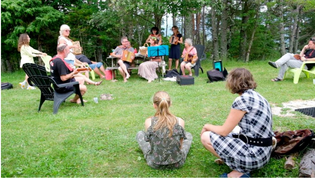
The Music Group Meyli-Meylo performing on my second day of fieldwork.