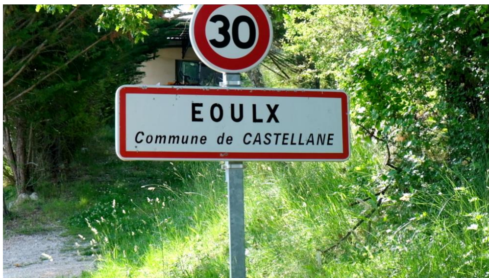
‘Eoulx – Commune de Castellane’ sign when entering the hamlet.