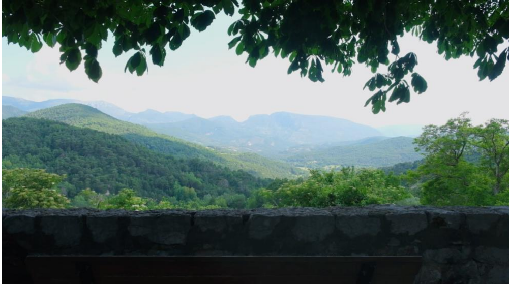
The surroundings and mountains sights when arriving to the destination on my first day of fieldwork.