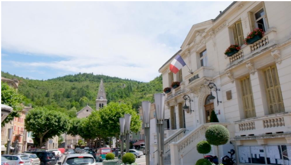
Castellane, the main village.