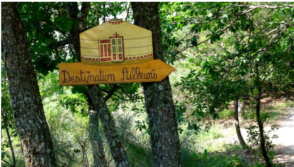
The sign when entering the property “Destination Ailleurs”