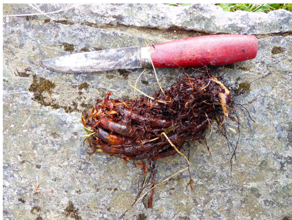
Fig. 3 Dryopteris expansa rhizome. At least locally, this species was preferred for fodder use, despite its relatively small size (cf. Fig. 3)

(in Norwegian floras: skogburkne ) as the source of the rhizomes used for fodder: “ Mollfôr fern roots of Skogburkne (...)” (NFS O.A. Høeg 785; 1971). With no specimen provided, or any further information, it is difficult to evaluate if this latter identification was correct or not.