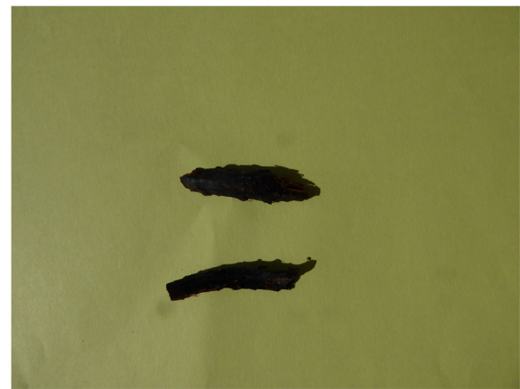
Fig. 5 Basal part of the petiole of Athyrium filix-femina , showing the spines referred to in folk tradition as identifying the harmful kind of moldfôr or fern rhizomes, generally rejected as fodder