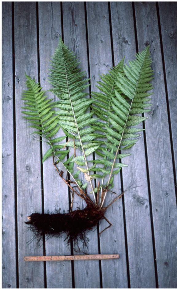
Fig. 2 Dryopteris filix-mas with its horizontal rhizome. This was a favourite source of rhizomes for fodder use in many areas. (= lysbilde 2000: 1170)