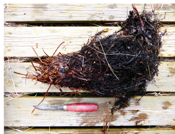
Fig. 1 Matteuccia struthiopteris rhizome. Although usually considered inferior to the Dryopteris species, its large rhizomes have been extensively collected for fodder use

My own records from the Harstad area in SE Troms suggested that Matteuccia struthiopteris and Athyrium filix-femina were the main species utilized there ([5]: 378), with the caveat that the male informant’s memory of the ferns he had participated in collecting sixty years ago may have been imprecise. Although distinctly dissimilar to a botanist, Athyrium filix-femina and Dryopteris expansa may well be confused by the layman; both have finely dissected, pale green fronds. A record from neighbouring Skånland also pointed to Athyrium filix-femina