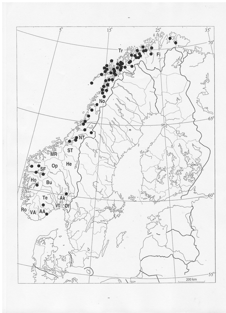
Fig. 6 Geographical distribution of the tradition of collecting fern rhizomes for fodder in Norway, compiled from a variety of published and unpublished sources. Two-letter codes indicate the main administrative units (counties): He Hedmark, Op Oppland, Øf Østfold, Ak Akershus, Vf Vestfold, Te Telemark, AA Aust-Agder, VA Vest-Agder, Ro Rogaland, Ho Hordaland, SF Sogn og Fjordane, MR Møre og Romsdal, ST Sør-Trøndelag, NT Nord-Trøndelag, No Nordland, Tr Troms, and Fi Finnmark. The small area of Os Oslo is included in Ak

terms of the part used: “ Telg meant the spring growth of the blom which they collect in spring for cattle fodder” ([4]: 326).