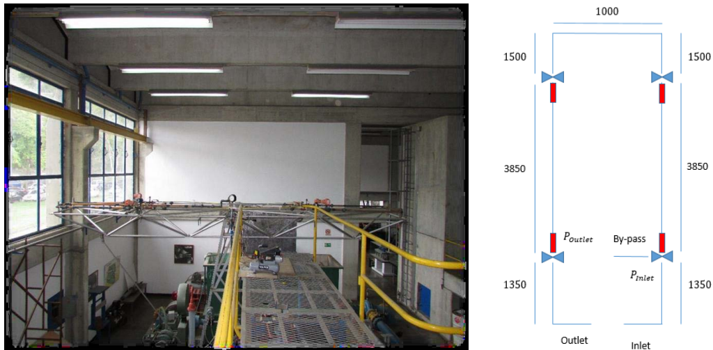
Figure 2. Test section indicating the location of the instrumentation. Dimensions in [mm].