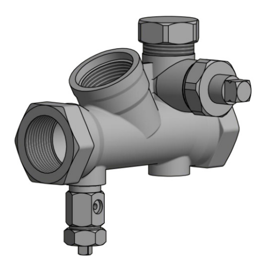
Figure 2. Example of a component.

In 2013, the assessment was based on a so-called reversed engineering task where students were asked to choose their own tool, component, gadget, toy etc. The students were given two weeks to model the chosen physical object. The lecturer approved the proposed object on the date the exam commenced. The examination answer consisted of engineering drawings of the model, and the physical objects were handed as guidance for the external examiner. The assessment was based on the level of difficulty and extensiveness of the modelling, and the quality of the engineering drawings. The exam contributed positively to the learning outcome, but more than a hundred unique drawings made the assessment too time-consuming. Figure 2 is an example of an exam answer.