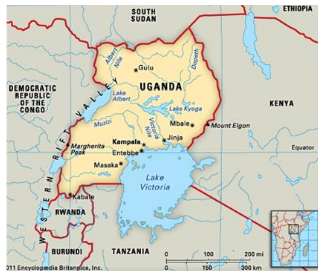
Figur 1: Map of Uganda

Uganda has an estimated population of around 41 million inhabitants of which 16.8 % of the live in urban areas (CIA, The world Factbook - Urbanization, 2017). The political and economic capital is Kampala, which is in Central Uganda at the shores of Lake Victoria and has approximately 1.9 million inhabitants. Other urban areas are Mbarara in the West, Gulu