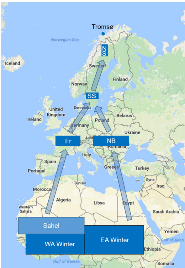
Figure 1. Approximate positions of areas for which climate data were downloaded along the migration route of Pied Flycatchers, Willow Warblers and Chiffchaffs between the wintering area and breeding area in North Norway (WA = West Africa, EA = East Africa, Fr = France, NB = Northern Balkans, SS = South Sweden and NS = North Sweden – see Appendix 1 for geographical coordinates of the areas). The western (Pied Flycatchers, Chiffchaffs) and eastern (Willow Warblers) return routes are indicated by arrows.

delay refuelling (Ahola et al. 2004, Gordo et al. 2005). Here, I relate arrival times of the three spring migrants to climatic conditions at the start of their northward migration and en route to North Norway to see where the responses are strongest.