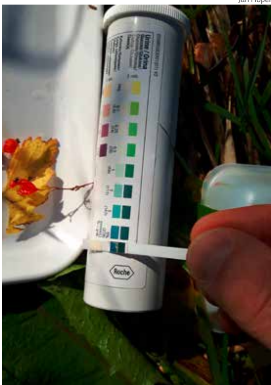
Figure 1: Testing redcurrants ( Ribes rubrum ) for glucose: the test strip matches to a high reading on the reference scale.