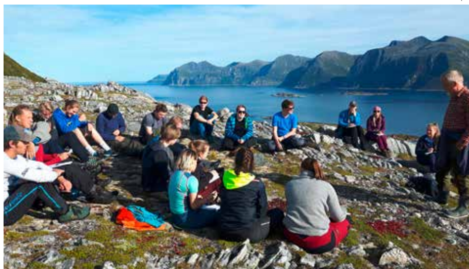
Field work in the Arctic: students enjoy fine weather while studying science outdoors

To test for starch, we used the iodine test in the form of Lugol’s solution (aqueous potassium iodide and iodine), as this simple test is well suited to taking out of the classroom, and only needs one droplet to produce a result.