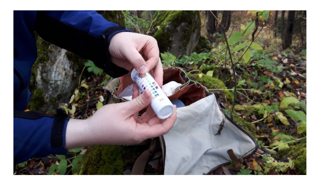
Figure 2. "Molecule detectives" outdoors, testing for glucose.

this course, acted as an outside observer during the teaching unit and conducted the individual interviews without the presence of the first author.