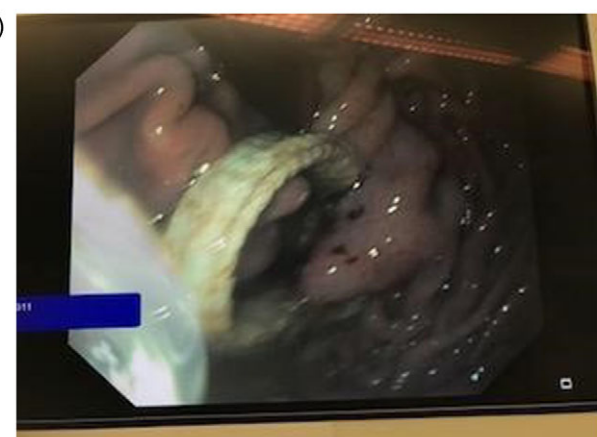
Figure 2: The figure illustrates the inserted stent. (a) The gastric stent in position in the stenosis and (b) the available gastric band due to tissue necrosis.

A common alternative is the removal of the ring or band through a gastrotomy done by laparoscopy [4]. However, recently some small studies and case series, using the replacement of a stent at the stricture, has been shown promising [4, 6, 7, 10]. The success rate of endoscopic removal of bands that have been almost intragastrically migrated by the use of tools as endoscopic scissors, laser or gastric banding cutters have been reported ranging between 56 and 100%. Blero et al. [4] reported one failures due to huge adhesions between the connection site of the band with the reservoir lining on the lesser curvature of the stomach and the lower face of the left liver lobe. They concluded that a two-step procedure would have solved the problem. In our case we employed this procedure. Initially, a coated stent was inserted and a pressure necrosis occurred during the following 2 weeks. This approach has also been employed by others [4, 10]. A temporary insertion of fully