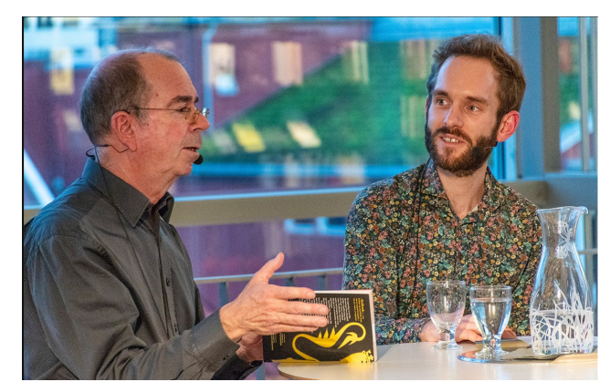
The author Jan Kjærstad (on the left) in conversation with the librarian.

About 80 persons came to the event the day after when the author visited the library. Again, women were the clear majority, but also about 15-20 men attended. The age did vary more than in the reading group with more young people, probably students, being part of the audience. 8 out of the 11 women from the reading group were also present. Only one of these asked the author a question. Several other participants asked a question when encouraged to do so. Compared to the conversation the day before, these questions asked by the audience did not lead to a conversation among the audience but only to an answer from the author.