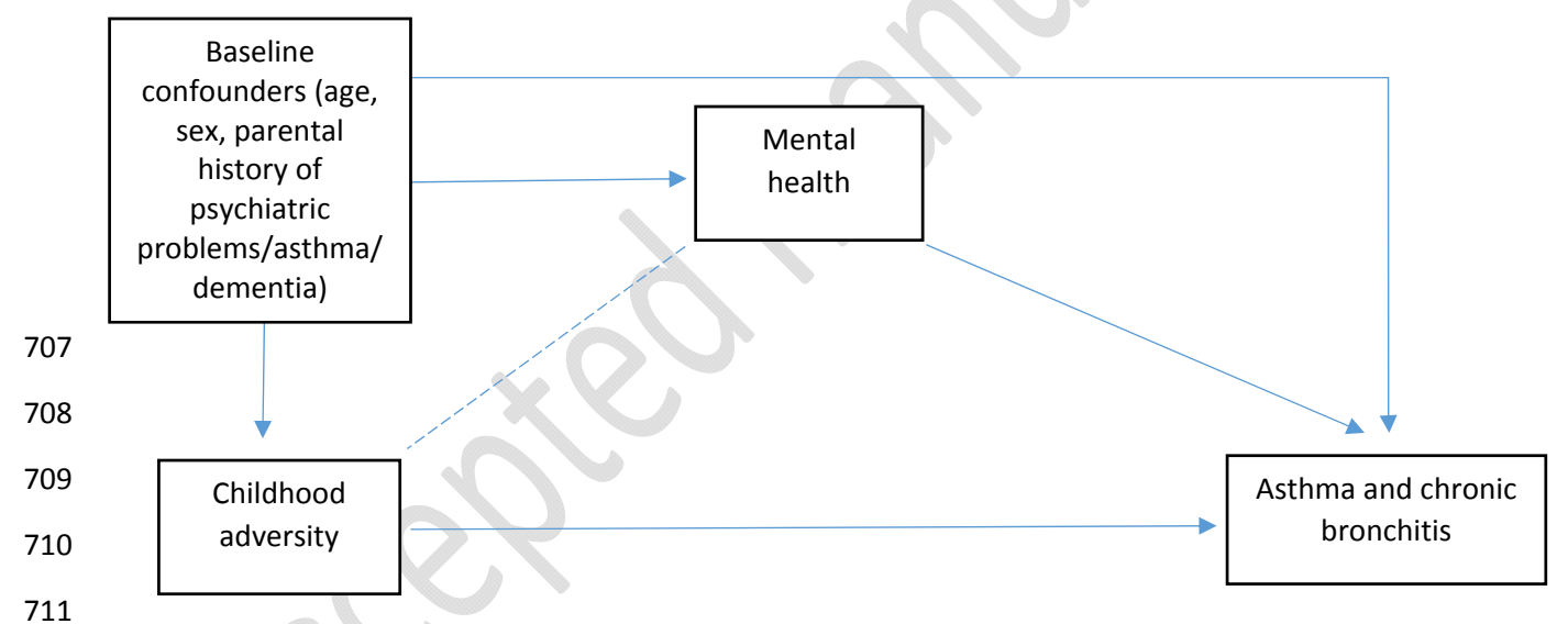
Figure 1. Role of mental health as a mediator (a) and confounder (b) in the association of childhood adversity with asthma and chronic bronchitis.