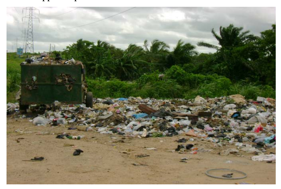
Fig.4.4. The picture depicts a refuse dump site right at the source of 'Budu Well'.

discussion with some locals what came up was that Liberians keep their homes clean but do not care what happen in public areas.