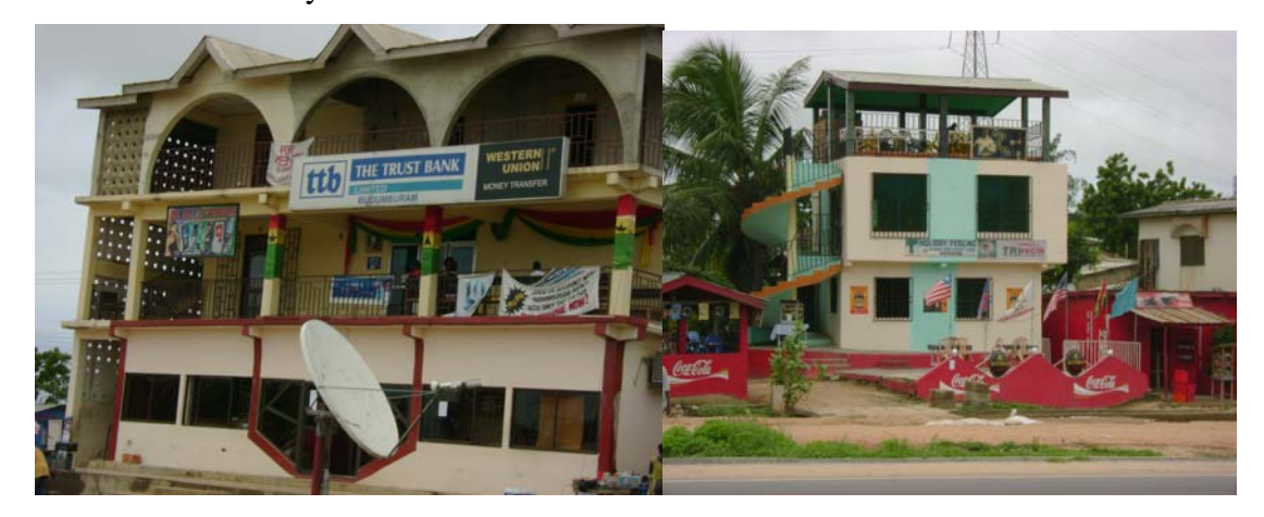
Fig.4.2. The pictures above show the extent of infrastructure development in Buduburam.

the habit of saving. This has been revealed as a benefit to both the refugees and members of the host community.