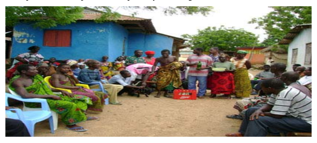
Fig.4.5. A gathering in the memory of the dead.

Sacred areas and forest reserves for the locals' religious activities are almost all destroyed due to human activities like the cutting of firewood and excavation of sand for constructions. Most of the Liberian refugees are Christians and also came from the cities. By virtue of their Christian tenets, they have a stereotype perception of the traditional beliefs and practices of the locals as paganism. Even though traditional practices like going to sacred places to honour the ancestors and the annual prayers for the dead and their families are still going on, the fear is that the young generation may not continue with such practices because of the stereotype that has been associated with them. Yet still the locals perform these practices, especially the old generation.