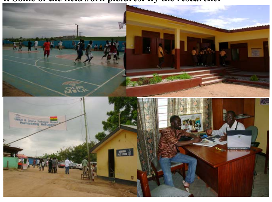
Appendix 4: Some of the fieldwork pictures

The red arrow and circle indicate where the host Gomoa-Buduburam community is located.