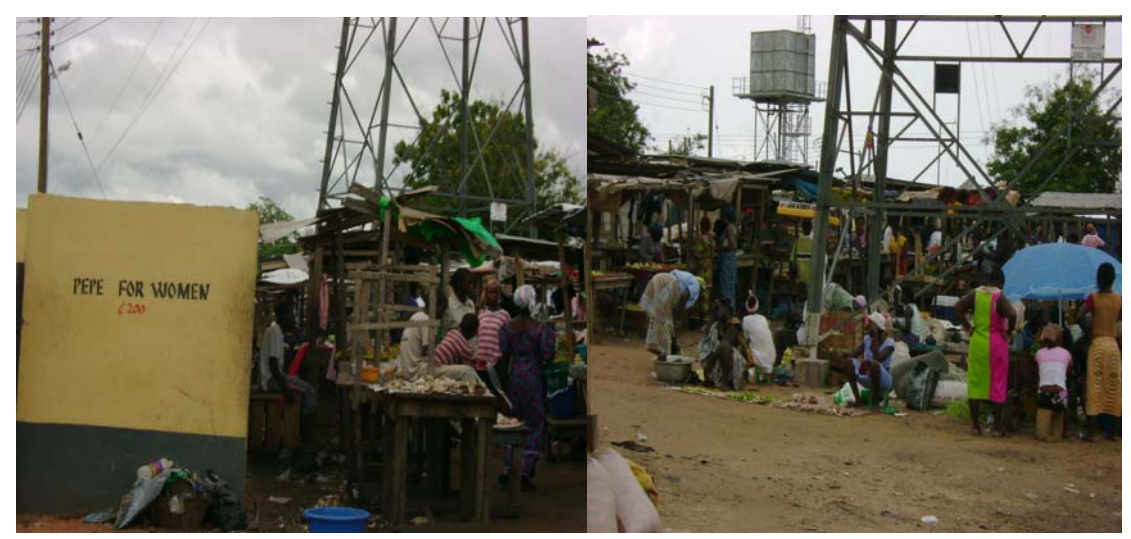
Fig.4.3. The pictures are illustrations of the impact of land scarcity in the community.

One could easily get a land to farm on or a place to set up a market stall, but now land is difficult to come by. The locals who are not able to get a place to sell are doing their trading just beside a toilet and under a high electrical tension. This is seen as a dangerous undertaking, though that is the only alternative available to them.