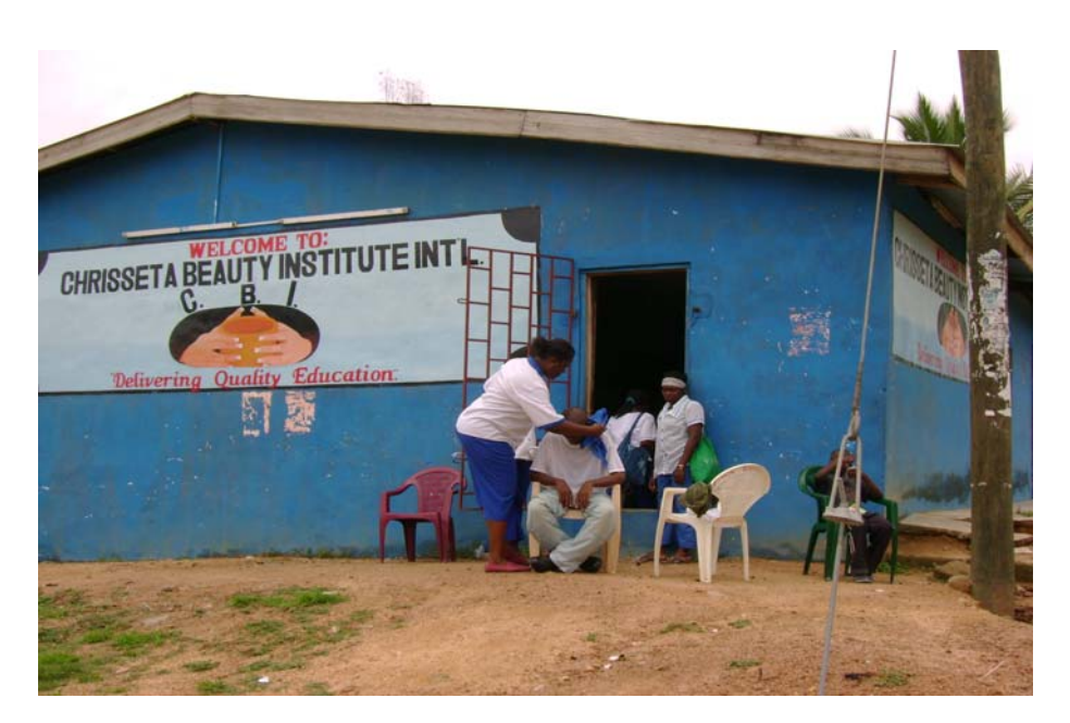
Fig.4.1 the picture above shows how skilful and dynamic refugees could be when given the necessary assistance and encouragement.

situation in Liberia was deemed safe for return. Moreover, the office facilitated the voluntary repatriation of over 3000 Liberian refugees (UNHCR, Ghana). Appropriate conditions for repatriation to Liberia, however, meant that continued assistance was no longer warranted. This has made the refugee become economically self-reliant by engaging in economic activities for survival. Small shops and tabletop displays offering basic necessities for both locals and the refugees characterise the camp. According to the information I gathered from the refugees' group discussion these types of business activities were learnt from their host because they were not used to it. Restaurants, entertainment centers and 'chop bars' are also present. Some refugees went for training to prepare themselves for income generation and thus engaged themselves in sewing, carpentry, construction, soap making, fish smoking, tie and dye and batik. Still some refugees generate income from these skills, especially construction and carpentry. In early 2000, the refugees managed to get their share with all the constructional work going on in the camp despite the competition they faced with local professionals. Many of the refugees were able to contract out their labour to other refugees to earn a small income.