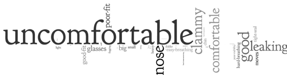
Fig. 1. Word cloud of the comments given by the workers using the respirators when giving the comfort scores. The area taken by each word is proportional to the number of respondents giving that word as a comment. The words included in the word cloud are in alphabetical order: allergic, best, big, breaks, bulky, chin, clammy, comfortable, dislike, easy breathing, elastics, face, fogging, glasses, good, good fit, good visibility, hard breathing, hard communicating, hard talking, hard to put on, hearing protection, heavy, heavy breathing, helmet, hot, itching, leaking, light, moves, neck, nose, not good, ok, painful, poor elastic, poor fit, poor visibility, small, soft, stiff, tight seal, unaccustomed, and uncomfortable.

also been shown in several other studies [15–17,19,21–25]. When it comes to respirators, it is clear that one model or one size does not fit all. The two silicone respirators models that performed best during the fit test and had by far the highest FFs of all the respirators included were available in three sizes, whereas FFABE1P3 and FFP3 respirators were produced in one size only. One of the FFP3 respirator models, Respirator K, the manufacturer specified that it was made for small faces. It had a high pass rate of 76%, being the 5th highest pass rate of the respirators, indicating that although the manufacturer specified that it was made for small faces, it fits other face sizes as well. The percentage of passed tests for the different respirators can be useful information when planning which respirators to include in respirator fit testing campaigns on a similar worker population. Lee et al. [21] screened different respirator models on a selection of 40 health-care workers and only included the two models that performed best in the screening for further fit testing. This approach resulted in a pass rate of 99.6% for the 1850 health-care workers tested with the two retained models. Minimizing the number of different respirator models that are necessary to include in the fit testing program is time efficient. In