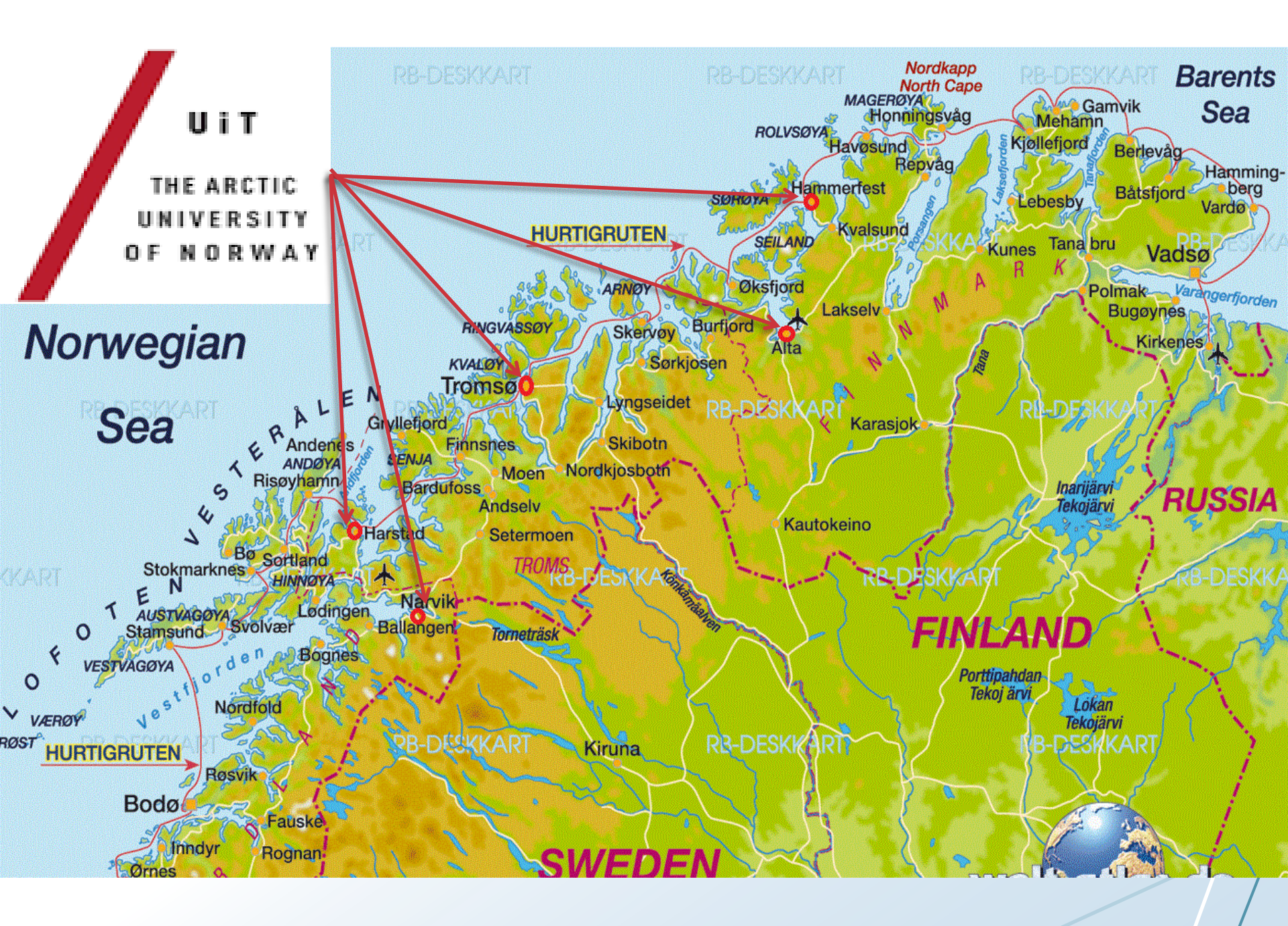
5 Campuses: Alta, Harstad, Hammerfest, Narvik, Tromsø