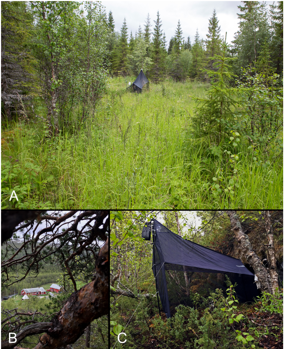
FIGURE 2. New collecting sites for Sciarosoma nigriclava (Strobl, 1898) in Norway. A. The Malaise trap at a rich fen at Åsen in Engerdal. Photo: Linn Katrine Hagenlund. B. Gargialia in Alta, with view down on Gargia Fjellstue. Photo: Jostein Kjærandsen. C. Just next to the old pine seen in B, the Malaise trap was deployed on a narrow ledge in the otherwise steep terrain. Photo: Jostein Kjærandsen.