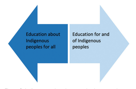
Figure 3. Indigenous education conceived as a continuum.

Indigenous education. The distinction between education for and of Indigenous peoples, on the one hand, and education about Indigenous peoples, on the other, reflects the situation in many countries, regions and communities where Indigenous peoples are present. In Norway, the national curricula (at least since the 1980s) demand this dual approach in relation to the rights and situation of Sámi students, and also to what all students should learn about the Sámi.