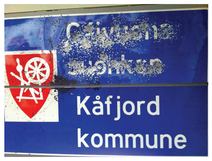
Figure 1. Road sign in Sámi and Norwegian – the Sámi name has been erased by bullets.

Around 1993, Kåfjord, a small rural municipality in Norway's far north, replaced monolingual Norwegian road signs with bilingual Sámi-Norwegian signs. These bilingual signs soon became subject to vandalism: the Sámi municipality name – "Gáivuona suohkan" – was painted over and even erased by bullet holes. In 2016, the linguistic landscape changed again. This time bilingual Sámi-Norwegian signs were replaced by trilingual Sámi-Norwegian-Kven signs. Today the full name of the municipality is Gáivuona suohkan-Kåfjord kommune-Kaivuonon komuuni (hereafter Gáivuotna-Kåfjord-Kaivuono). This time all the signs were left untouched. The tensions seem to have gone.