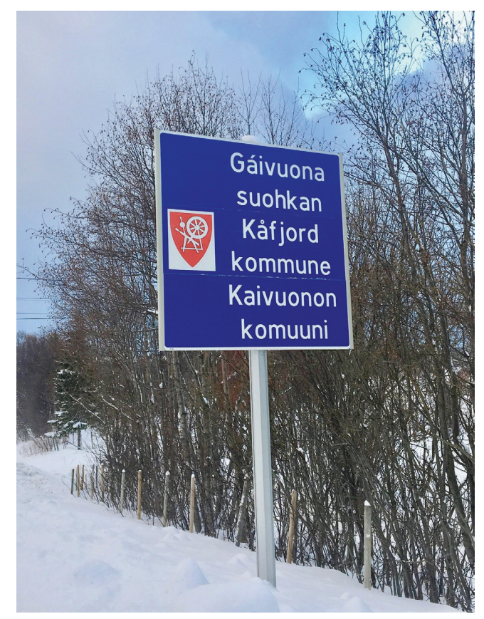
Figure 2. Road sign in Sámi, Norwegian and Kven.

According to Blommaert,1 a changing linguistic landscape can be seen as diagnostic of socio-linguistic changes. What seems to be changing in Gáivoutna-Kåfiord-Kaivuono is the social status of the minority languages, and thus perceptions of citizenship and belonging. Stroud points out that "[f]eeling in or out of place is one of the determinants behind whether individuals are able to exercise agency and local participation as well as whether encounters across difference are expressed as contest or as conviviality."2 Although the empirical context of Stroud's analysis is the transition from apartheid to democracy in South Africa. his viewpoints echo with the colonial and post-colonial experiences of the Indigenous and minoritised people of the Arctic. Thus the multilingual road signs in Gáivoutna-Kåfjord-Kaivuono material symbols of political tensions and changes in Norway, and they represent a story of decolonisation.3