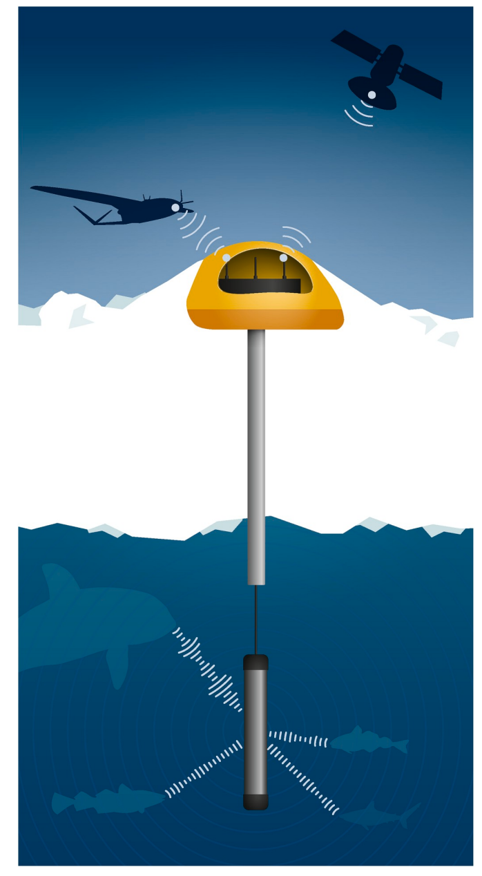
Fig. 2. An example of an ice-tethered observatory. This example is of the bioacoustic observatory.

Another method for gathering data in ice-covered waters is the use of floating ice-tethered observatories. An ice-tethered observatory can be described as a buoy equipped with different sensors to perform measurements in the ice and/or the underlying water column. The term 'icetethered' refers to the deployment of the observatory, which is done by drilling a hole in the ice and lowering the observatory into the underlying water column until the sensors reach the targeted depth (Fig. 2). Ice-tethered observatories have previously been deployed as part of other research projects, such as the Ice, Atmosphere, Arctic Ocean