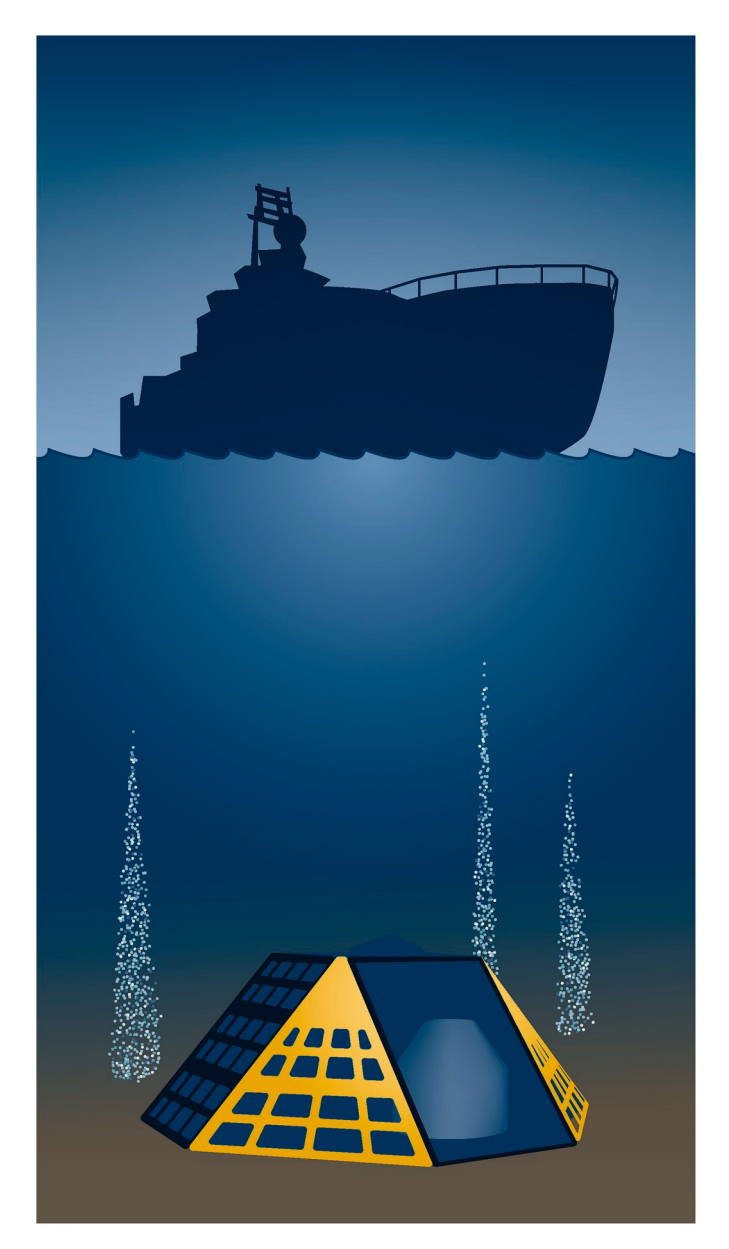
Fig. 1. The K-Lander ocean observatory seen on the seafloor as an example of a seabed structure. The white plumes represent gas seepages.

retrieved along with the equipment. So far, the K-Landers have been deployed and retrieved twice along the West Spitsbergen continental margin and in the Barents Sea.