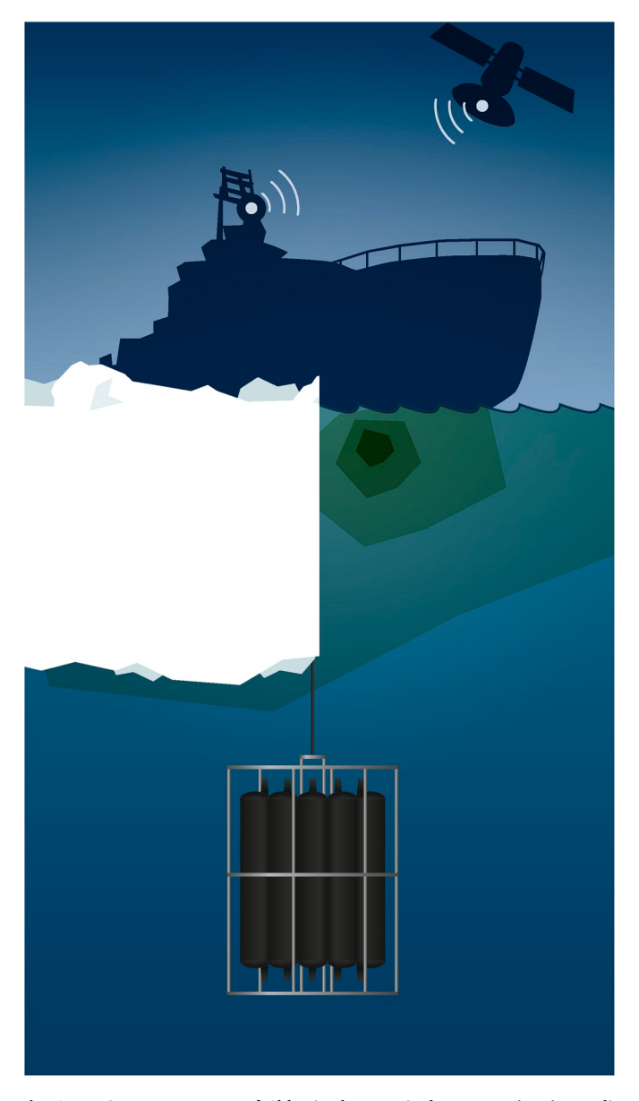
Fig. 3. In-situ measurement of Chl-a in the Marginal Ice Zone (MIZ) coordinated with overpass of satellite, as an example of remote sensing.

A third way to obtain data from the Arctic Ocean is by using remote sensing technologies. Satellite remote sensing is a technology where sensors mounted on satellites are used to acquire information from an object or phenomenon on Earth [24–26]. The data obtained is then often used for the purpose of improving natural resource management and the protection of the environment [27]. A significant part of the Arctic