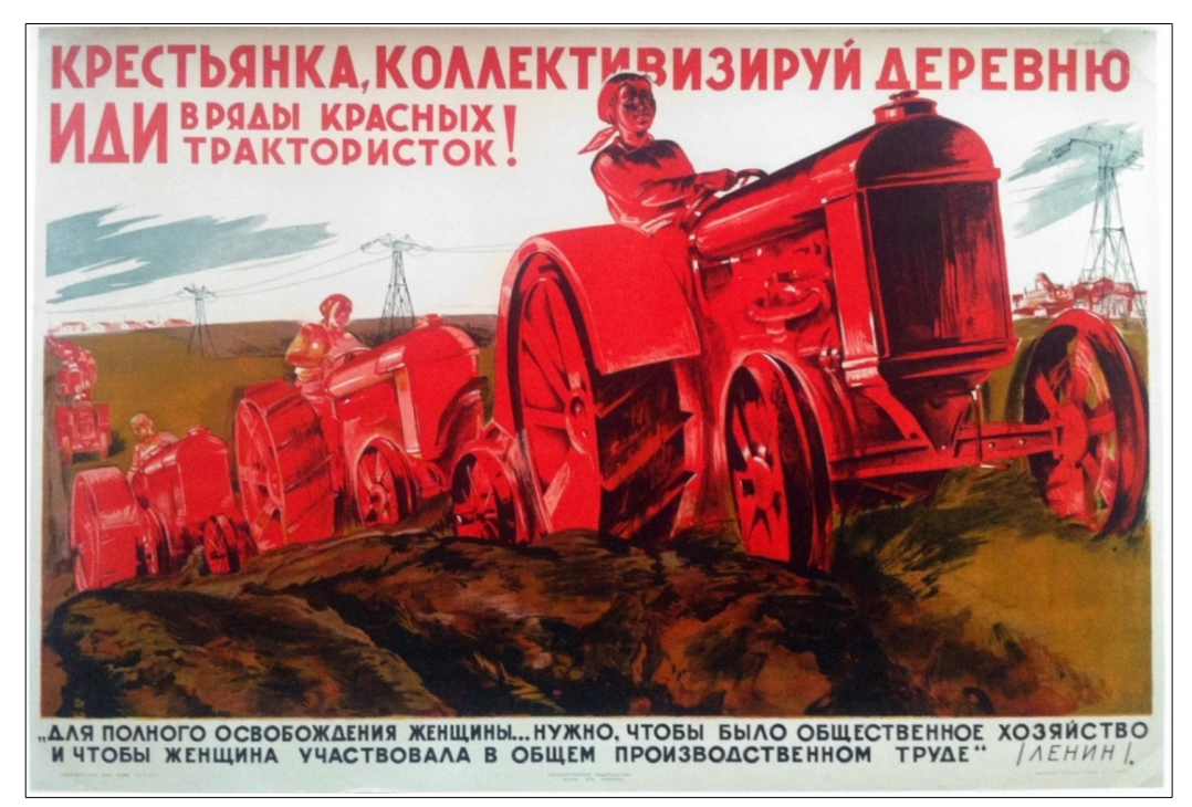
Image 1. 'Peasant woman, collectivize the village. Join the ranks of Red Female Tractor Operators'

Is it possible that the organic/synthetic divide and the idea of humanness inevitability stemming from biology were less important in the USSR? During the industrialisation of the 1930s in particular, the ideal of the man-machine was communicated through art and political propaganda. This was not merely conveyed through an image of the industrial worker, but to a high degree through that of the industrialised farmer, typically pictured as a woman on a tractor (see image 1). The Soviet view of nature was also highly instrumental: nature had a low value in and of itself and was considered something available for exploitation and human industrialisation.<sup>9</sup>