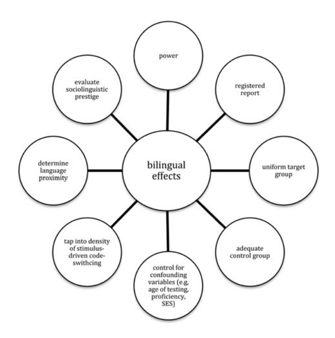
Fig. 2. A summary of critical factors that are relevant for capturing the source and robustness of the bilingual effects

These factors can help us, by virtue of multi-lab comparisons using the same measures and methods, to fully understand the relative weights of key potential aspects differentiating these groups and individuals in terms of cognitive bilingual effects. There is no shortage of great labs across the globe where Spanish exists as either (one of) the main societal language(s), a minority home language under various SES conditions, or a popular second language. Once a common set of experiments