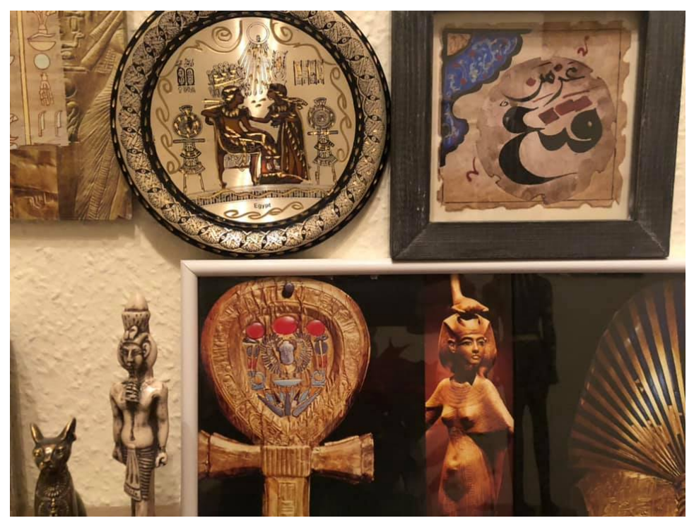
Figure 3. A photo of a part of the room's wall

In their language, they used references to the Egyptian revolution and Egypt all the time, even out of context. This is exemplified by a conversation that took place between two of my informants in Berlin.