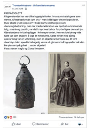
125 likes, 14 shares, 7 comments