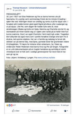
617 likes, 76 shares, 137 comments

I will in the following have a closer look on the three posts with most likes. Two of these three posts belong to the category "Fredagsgløtt", while the third one provides information on how to make a bee-hotel.