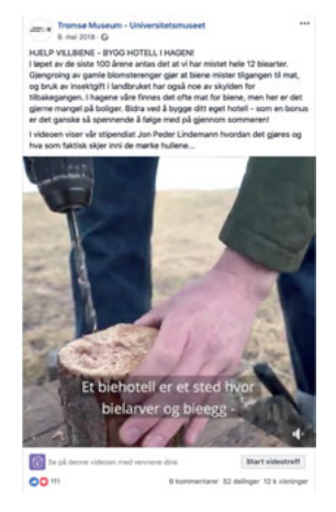
111 likes, 52 shares, 6 comments, 12 k viewings

The post with by far most likes (617) presents an old photograph where family and neighbors are gathered around four open coffins. The accompanying text explains the tragical drowning accident that happened on a warm summer day in 1927. The name and age of the persons involved in the accident as well as the name of the place are mentioned in the text.