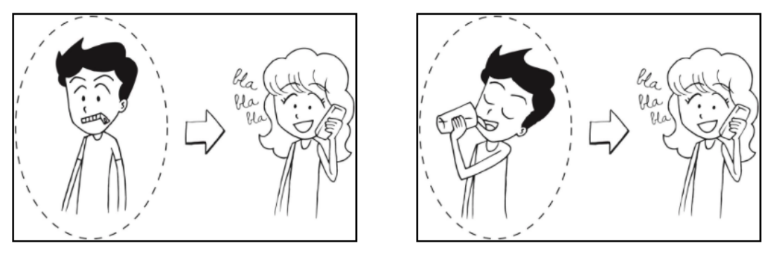
Figure 1 Screenshot of an experimental item