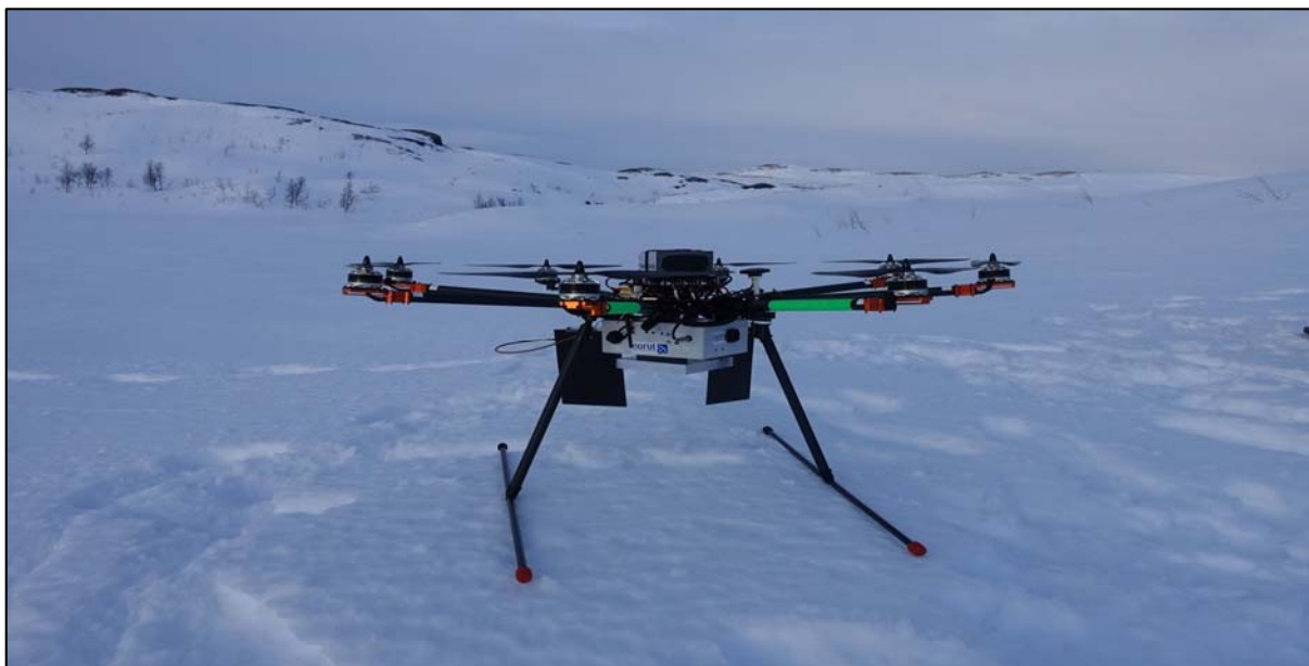
Figure 1: UAV-borne radar system. The UWibaSS is the grey box mounted beneath the UAV, with the transmitting antenna (grey plate) and both receiving antennas (black sheets) visible.