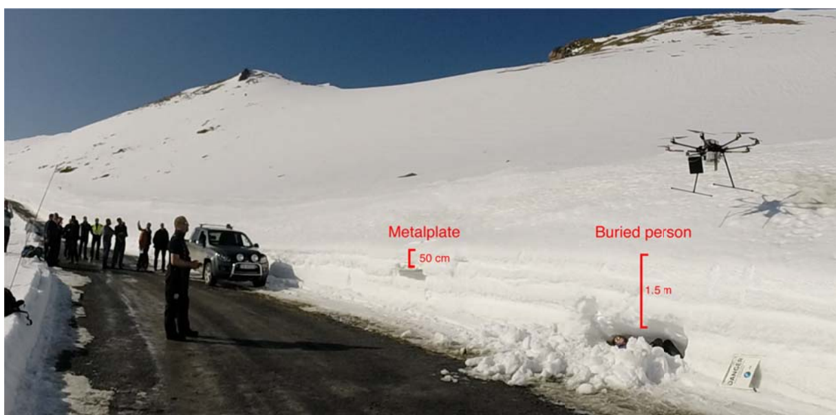
Figure 4: Setup of the object burial test with a metalplate and a buried person 50 cm and 1.5 m below the snow surface.

In similar snow conditions to the 50 m transect, into the side of a snowbank, a metal plate and a person were buried. We flew the UWibaSS four times over both targets, with the best result shown in Figure 5. Below the clearly visible snow surface, two hyperbolic reflections are visible, indicating the metal plate and the person buried in the snow.