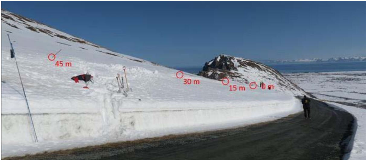
Figure 2: Setup of the 50 m transect with snowpit locations indicated every 15 m.

We found challenging snow conditions in the transect, which required some postprocessing of the radar data. The snowpack consisted of wet snow in the upper 70 cm with an estimated liquid water content of 3-8 %, whereas the lower 50 cm had a liquid water content of 0-3 %. Pronounced layering was mostly missing the upper half of the snowpack, whereas two prominent melt-freeze crusts were found towards the bottom of the snowpack (Figure 2). Densities ranged between 444 and 571 kg/m 3 , likely a function of the liquid water content and the large grain sizes.