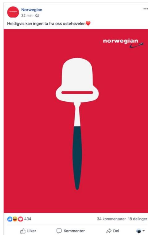
Screenshot of Norwegian's Facebook page 12.02.2020

published during the first 48 hours after the release of the video, both from traditional media like the Norwegian public broadcaster (NRK) and newspaper like Dagbladet and VG , but also alternative news sites like resett.no and document.no . 13 All these documents can form one or several document complexes, depended on whether we chose the content or the content plus producer as the criteria to include or exclude a document. As for other digital documents, this connectivity makes it difficult to define the exact boundaries of a document and to decide what documents should be included in the document complex for an analysis. As time passes by the amount of comments to the social media posts can become huge and also the number of other documents related to the video can increase significantly. One example of a related document is a post on the Facebook page of Norwegian, another competing airline company. The same day as SAS reposted the new version of the video, Norwegian posted an image with an accompanying text: "Fortunately, nobody can take away from us the cheese slicer."