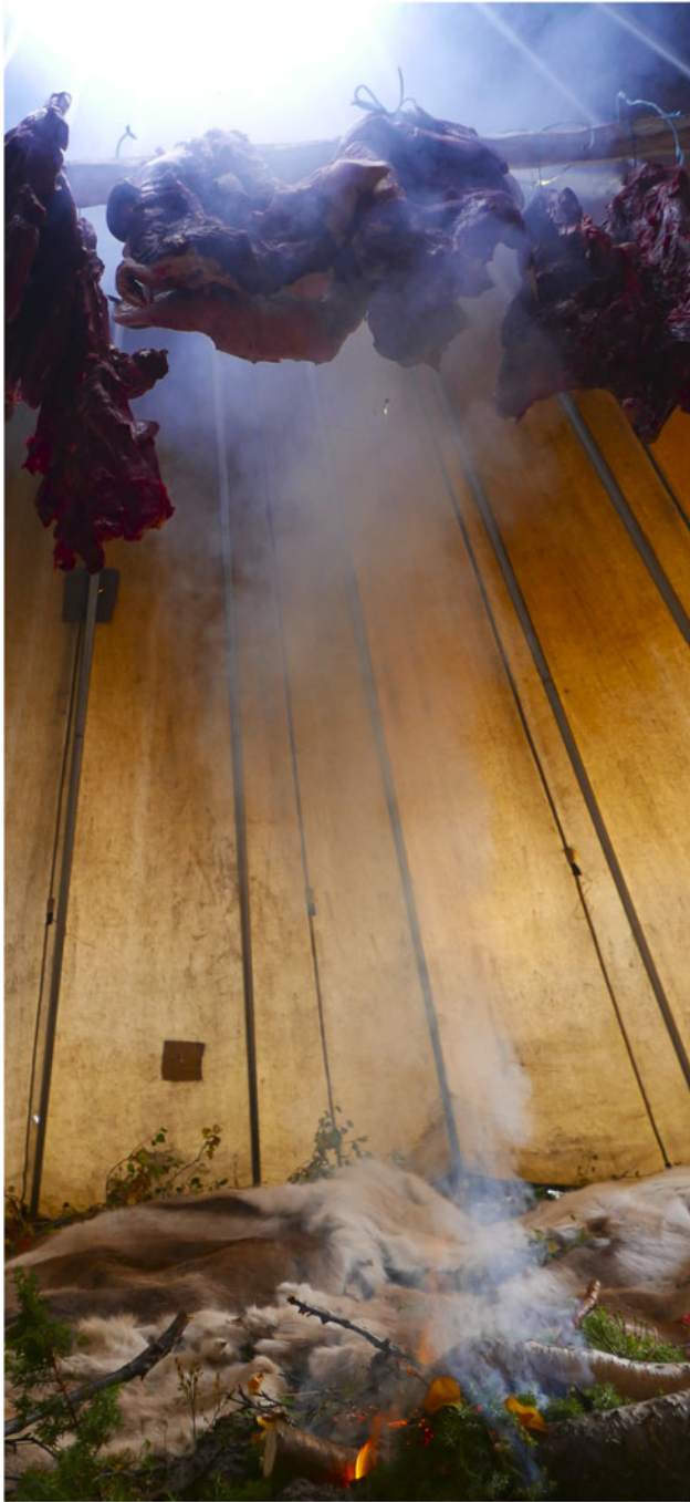
Fig. 4. Sami traditional meat smoking with birch and juniper in a lávvu (Sámi tent).

traditional knowledge is local knowledge, unique to its given culture. Traditional knowledge often combines knowledge and practices to give a holistic understanding of human interaction with their surroundings (Nakashima & Roue, 2002). Reindeer herding is a complex human-coupled ecosystem (Magga, Mathiesen, Corell, & Oskal, 2011), and traditional knowledge is embedded in complex networks of social relations, values, and practices (Nadashy, 1999, p. 5).