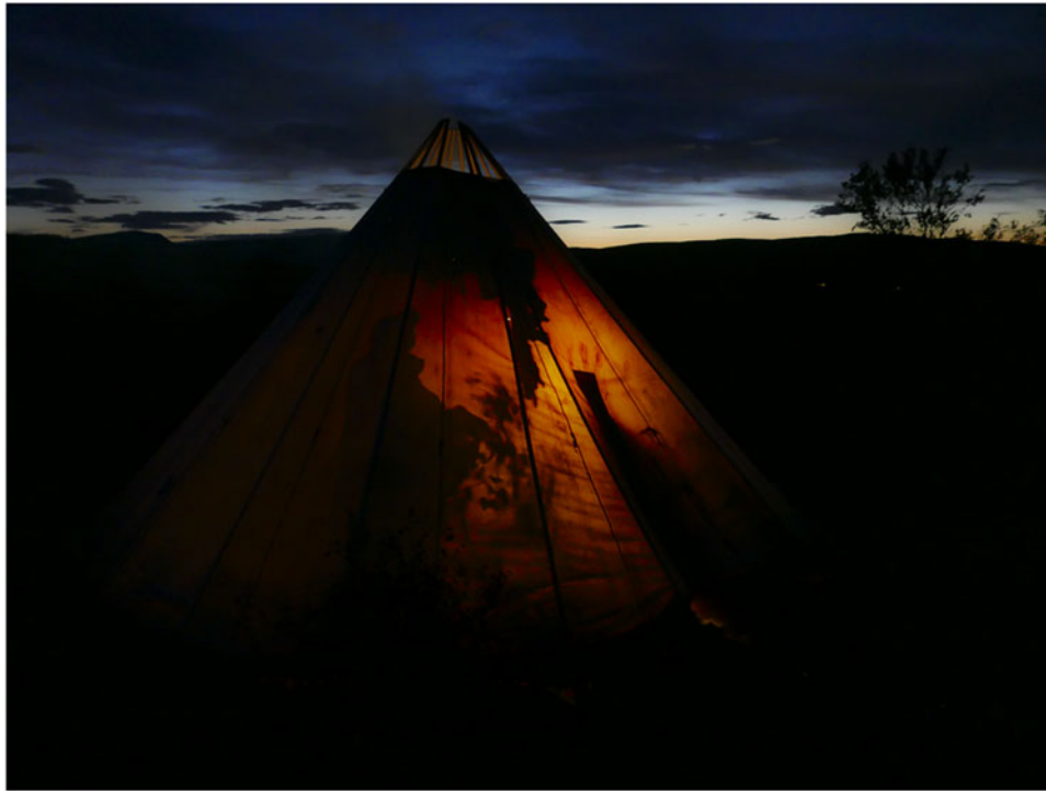
Fig. 1. reindeer herder smoking reindeer meat in a traditional Sámi tent—the lávvu.

may be lost if essential knowledge is excluded, we finally argue for the necessity of including traditional knowledge in future studies of traditional practices.