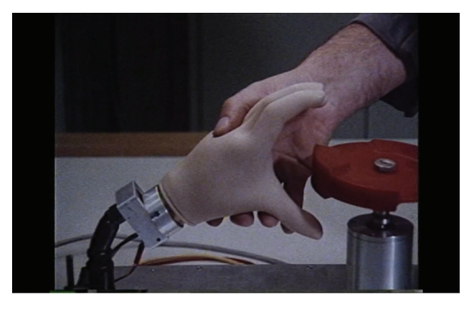
Figure 5. Wie Man Sieht (As You See 1986).

The recurring motif of two hands touching—stubbing, pressing, caressing—calls to mind Maurice Merleau-Ponty's observation of how the hand touching becomes the hand touched ([1945] 1962, 92-3). Continuously oscillating between object and subject, sensible and sentient, our hands relentlessly alternate their roles as exterior tools and internal sensors. Since our hands are symmetrically opposed, however, the two can never unite. This is also the premise for Vilém Flusser's reflections on "The Gesture of Making." In order for the left hand to coincide with the right, our hands would have to be able to move in a fourth dimension, while in reality, as Flusser notes,