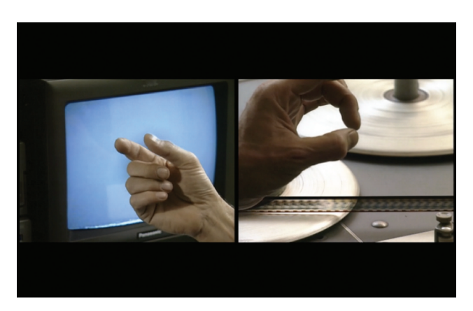
Figure 6. Schnittstelle (Interface 1995).

In soft montage, two images gesture toward an unnamed and perpetually deferred third. This principle lends the title to Vergleich über ein Drittes (Comparison via a Third 2007), a double-screen