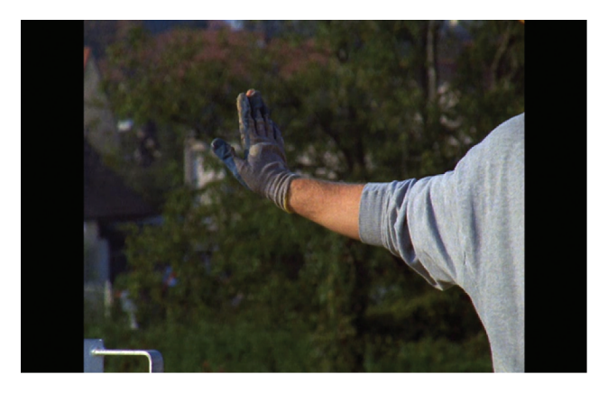
Figure 9. Zum Vergleich (In Comparison 2009).