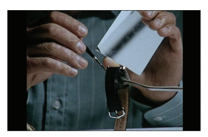
Figure 1. Stilleben (Still Life 1997).

In the first theoretical treatise on cinema, penned by the perceptual psychologist Hugo Münsterberg in 1916, the distilled emotional expressivity of the human hand, isolated and magnified in close-up, is singled out as the center of attention for the new medium. "Here begins the art of the photoplay," Münsterberg declares, with "one nervous hand which feverishly grasps the deadly weapon," or with "a play of the hands in which anger and rage and tender love or jealousy speak in unmistakable language" (1916, 87, 113). Chiming with the prevailing discourse at the time, Münsterberg takes the