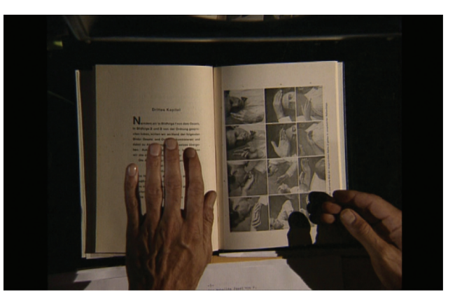
Figure 2. Der Ausdruck der Hände (The Expression of Hands 1997).