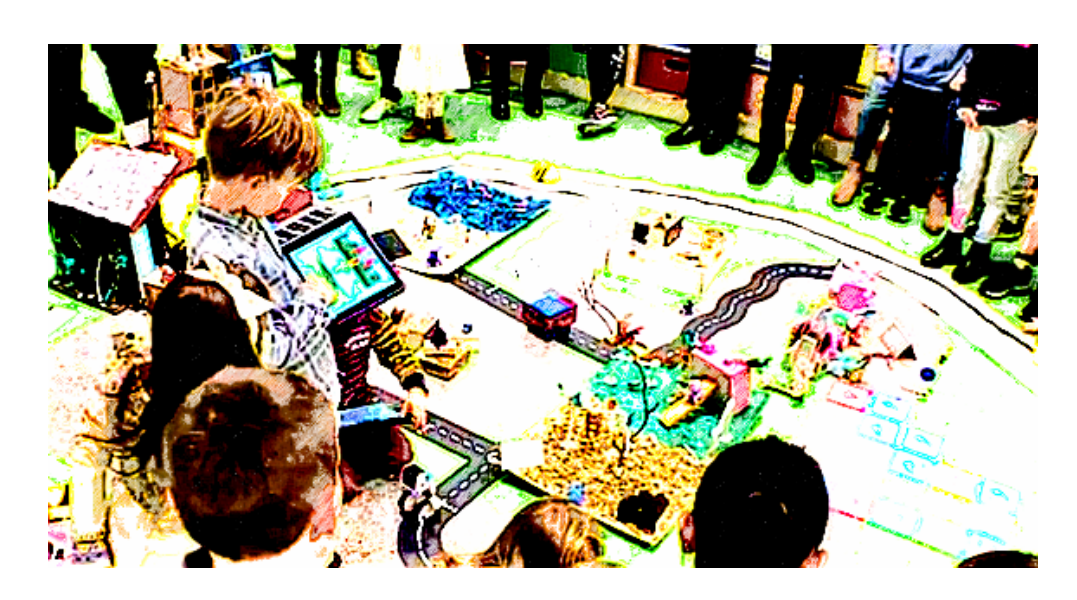
Figure 3 Robot city for all robots to live happily together.

can be seen by the boy holding the iPad), but see it enacted in the physical world of their coconstructed Robot city. It offers two different modalities for the child to experience the life of the robot in this city.