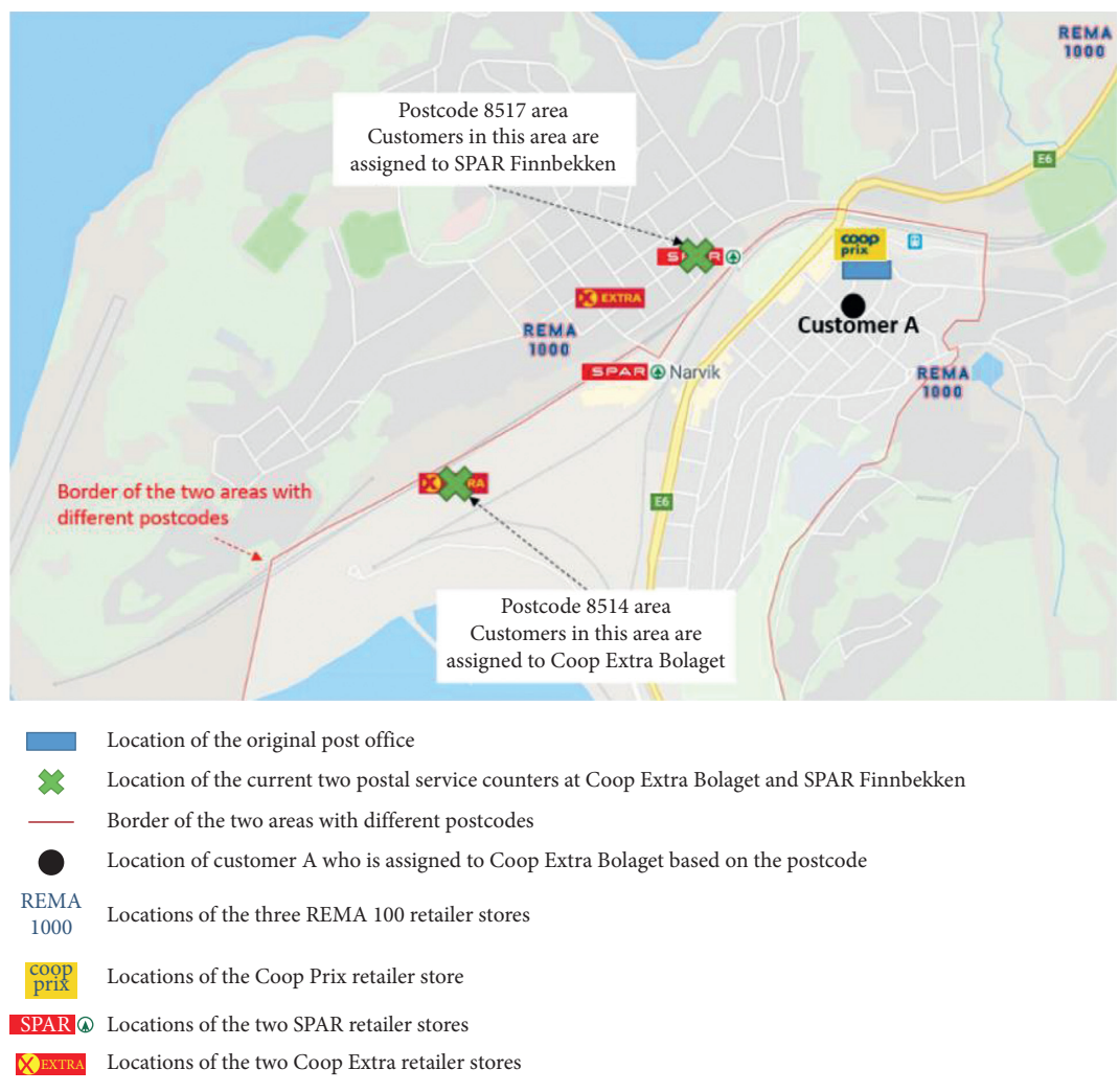
FIGURE 1: Locations of the original post offices, the current postal service counters, and the candidates for postal service counters.