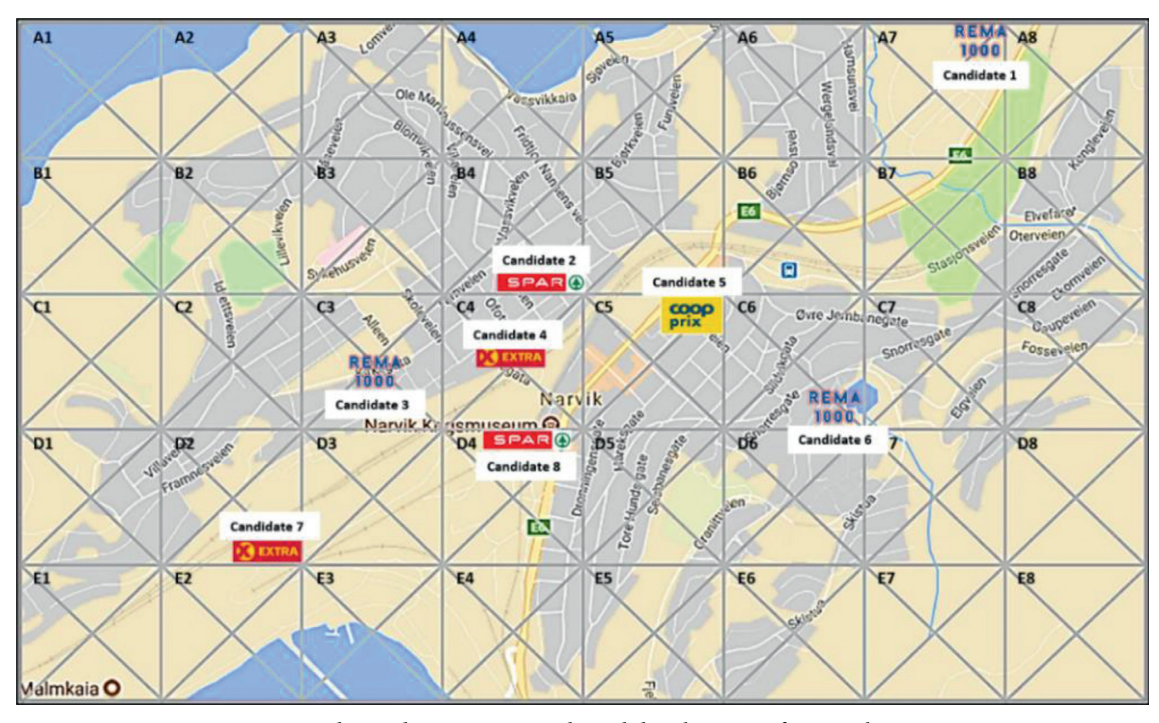
FIGURE 4: Customer demand aggregation and candidate locations for postal service counters.