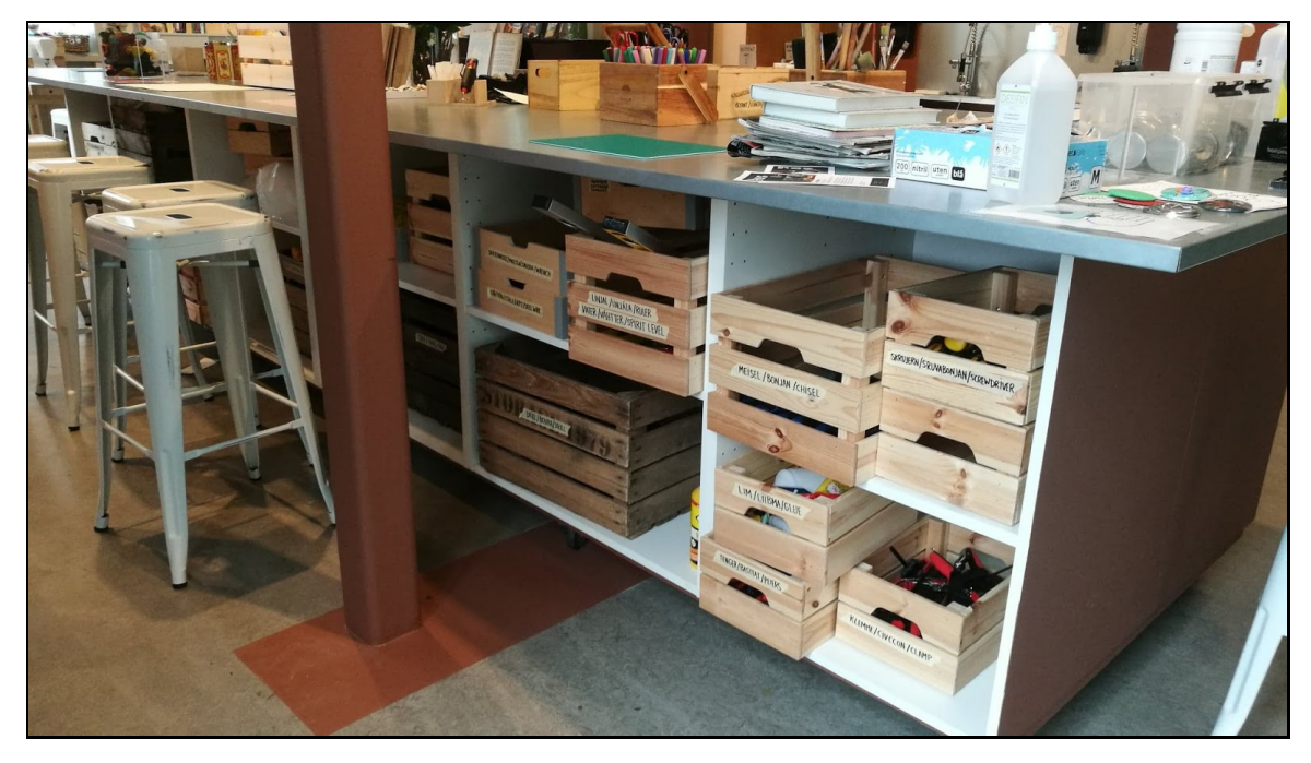
Figure IV. HOS NNKM 's makerspace, with labelling in Norwegian, North Sámi, and English.

The makerspace and café both normalised Sámi-ness through language. Kasmani (2018) has said that "all language is political and it shapes the power dynamics and the narratives, and tells about the knowledge and epistemologies at play" (12:46). As shared community spaces, both required written language, whether to communicate menu options or where to find craft supplies. Local community language was prioritised, and this local community included Sámi speakers, with every label, drink option, or activist motto written in Norwegian, English, and Northern Sámi – in fact, the decorative phrases on the walls often prioritised Sámi, writing it first or larger. This language diversity extended into the programming as well, with guided exhibit tours offered in Northern Sámi – again, a NNKM first (NNKM, 2020b).