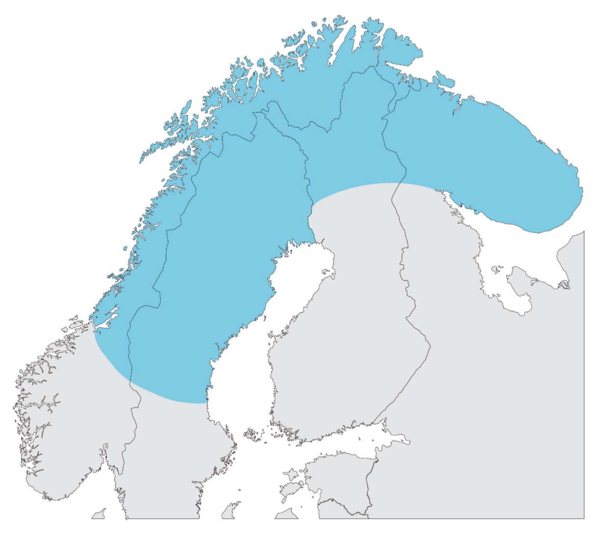
Figure 2. Map: Bjørn Hatteng, UiT The Arctic University of Norway. Sápmi borders. Adapted from BHatteng (2021).

and utilization of marine species from lower trophic levels in the food web and investigates the accuracy of their definition as "new" species related to their qualification as a novel food for the European food market. Although the investigation is still ongoing, from a preliminary assessment, such newness, or novelty, seems to be related to the expected and not yet tested potential health and nutrition benefits of the ocean species. In our view, the exploration of the multifold range of benefits is likely to lead to the categorization of many of such resources as "traditional food from a third country" (Art. 3, comma 2 (c) of Regulation 2015/2283/EU (2015) [3]), rather than novel food. Their feature as "traditional" is assessed within the biocultural context of Northern Norway and Sápmi (Figure 2).