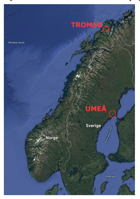
Figure 1 - Tromsø an Umeå municipalities location

growth of the municipality to around 83 000 inhabitants in 2050 (Statistiska sentralyrån 2021), while the housing plan planned for 120 000 inhabitants in 2044 (Tromsø kommune 2015, p. 5). Tromsø has had a steady and high population growth over a long period of time. A slower population growth is however expected for the upcoming years (Utbyggingsprogram Tromsø Kommune 2020, p. 4). The city is expensive to live in, in 2020, the city was the 2nd most expensive city in Norway after the capital Oslo. The price growth on housing went up 8.5% from the start of 2020 to November the same year. Simultaneously, the city experienced a negative population growth (Løtveit, 2020). The population density is 31 inhabitants per square kilometer, but 90% of the population live in towns. Furthermore, 77% of the inhabitants