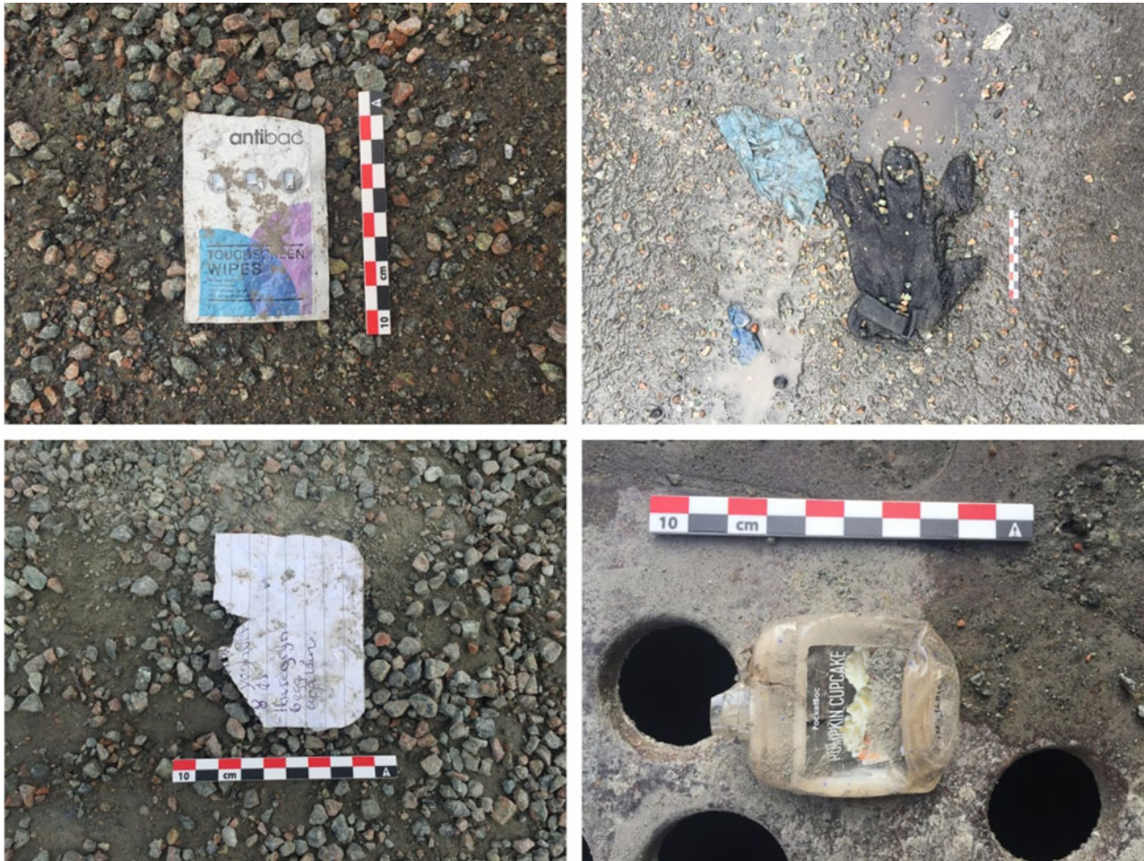
FIGURE 2. Sample of materials recorded during surveys of the downtown area photographed on April 20, 2020: (top left) antibacterial screen wipes; (top right) winter and protective gloves; (bottom left) shopping receipt; (bottom right) antibacterial hand sanitizer.

Using the camera phone on an iPhone 6, we moved around selected objects in a circle, varying camera height and angle. Between 27 and 47 photos were taken for each artifact (see Figure 3) and processed using Agisoft Metashape (for discussions on related expedient photogrammetric workflows, see Magnani et al. 2016, 2018). We acknowledge that Agisoft Metashape is not widely used by the broader public, although it has become standard in archaeological contexts. We point readers toward other open-source or low-cost alternatives available for devices from phones to computers on various operating systems (e.g., 3DF Zephyr Free, 3DS for Android OS, and Trnio for iOS).