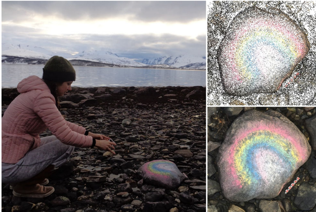
FIGURE 3. (left) Natalia Magnani collects data for a photogrammetric model of an ephemeral chalk representation on the southwest of the island; (right) images representing the workflow for photogrammetric modeling in Agisoft Metashape, from (top) sparse cloud generation to (bottom) generation of a textured model.