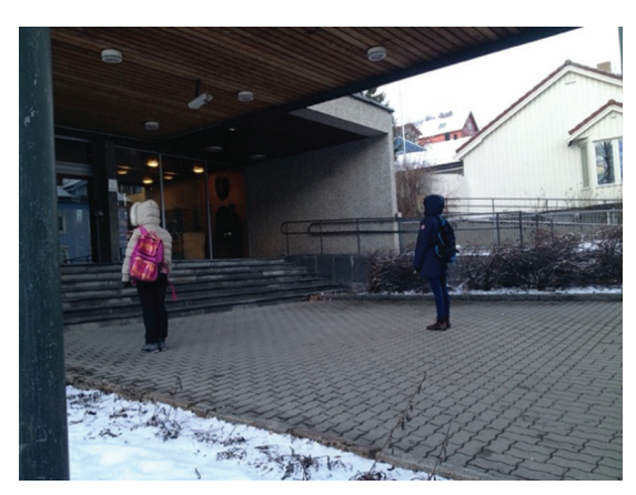
Image 6. Students doing the exercise "Do an action that adds something to a chosen public place" outside the police station.

An important agent in this exercise was the chosen public sites and the fact that we were working outside of designated art spaces. The students expressed how meaningful it was for them to experience how much the site affects the performance.