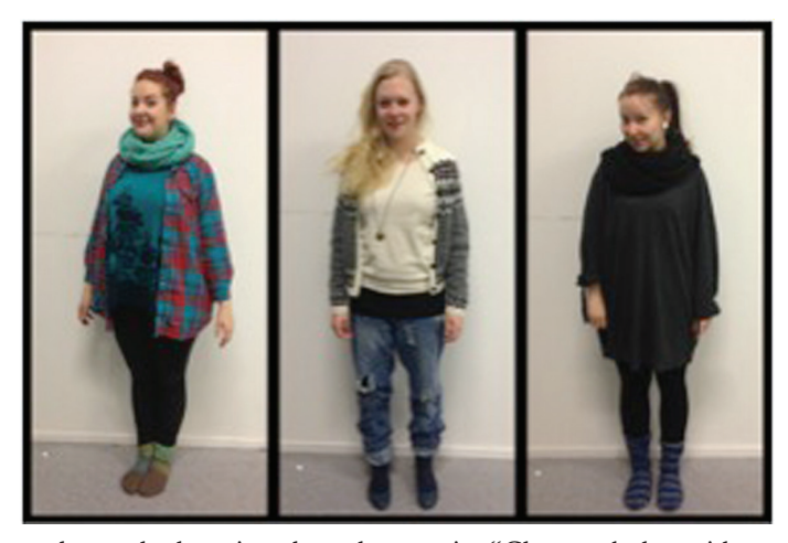
Image 2. Three students who have just done the exercise "Change clothes with another person in class".

Half of the students I interviewed mentioned this exercise spontaneously. Some of them expressed that this exercise was an eye-opener regarding what it means to perform yourself. At least three students used the act of undressing and dressing as