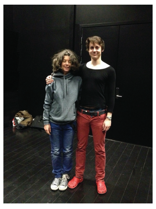
Image 1 . Two students who have just done the exercise "Change clothes with another person in class."

are a bit too small or very baggy, and they looked somewhat awkward and different. The atmosphere in the class also changed. The students had a new energy; they were laughing, commenting on one another's looks, taking pictures, and talked about how their feeling about themselves had changed immediately.