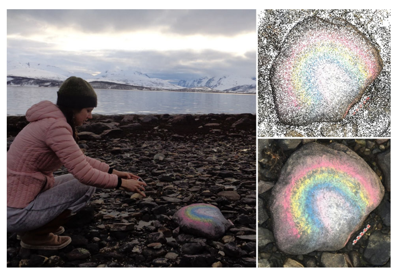
FIGURE 3. (left) Natalia Magnani collects data for a photogrammetric model of an ephemeral chalk representation on the southwest of the island; (right) images representing the workflow for photogrammetric modeling in Agisoft Metashape, from (top) sparse cloud generation to (bottom) generation of a textured model.