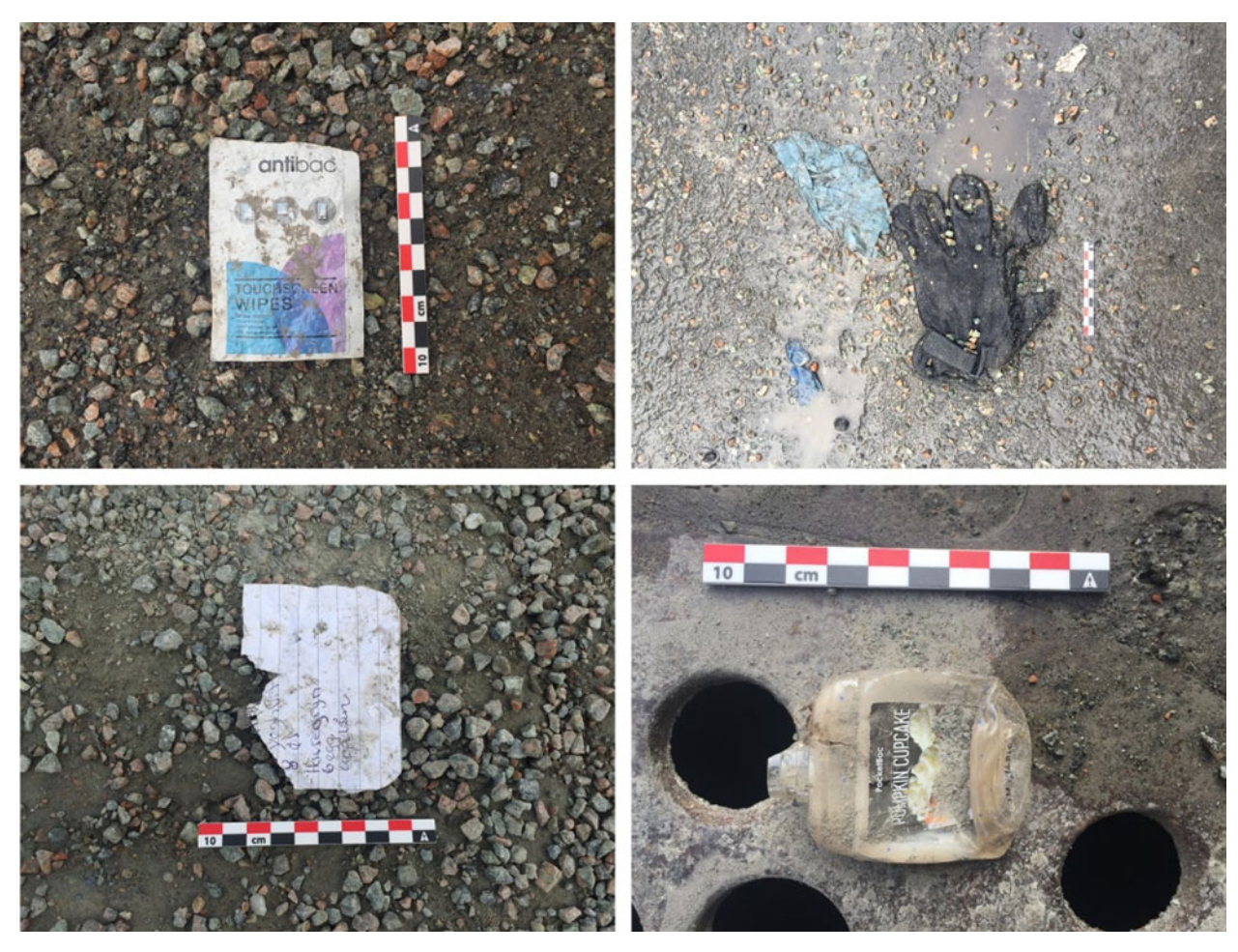
FIGURE 2. Sample of materials recorded during surveys of the downtown area photographed on April 20, 2020: (top left) antibacterial screen wipes; (top right) winter and protective gloves; (bottom left) shopping receipt; (bottom right) antibacterial hand sanitizer.

Using the camera phone on an iPhone 6, we moved around selected objects in a circle, varying camera height and angle. Between 27 and 47 photos were taken for each artifact (see Figure 3) and processed using Agisoft Metashape (for discussions on related expedient photogrammetric workflows, see Magnani et al. 2016, 2018). We acknowledge that Agisoft Metashape is not widely used by the broader public, although it has become standard in archaeological contexts. We point readers toward other open-source or low-cost alternatives available for devices from phones to computers on various operating systems (e.g., 3DF Zephyr Free, 3DS for Android OS, and Trnio for iOS).