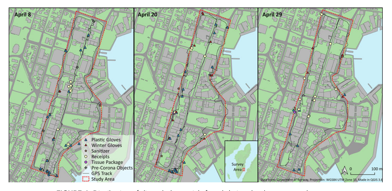
FIGURE 4. Distribution of discarded materials found during the three reported surveys.