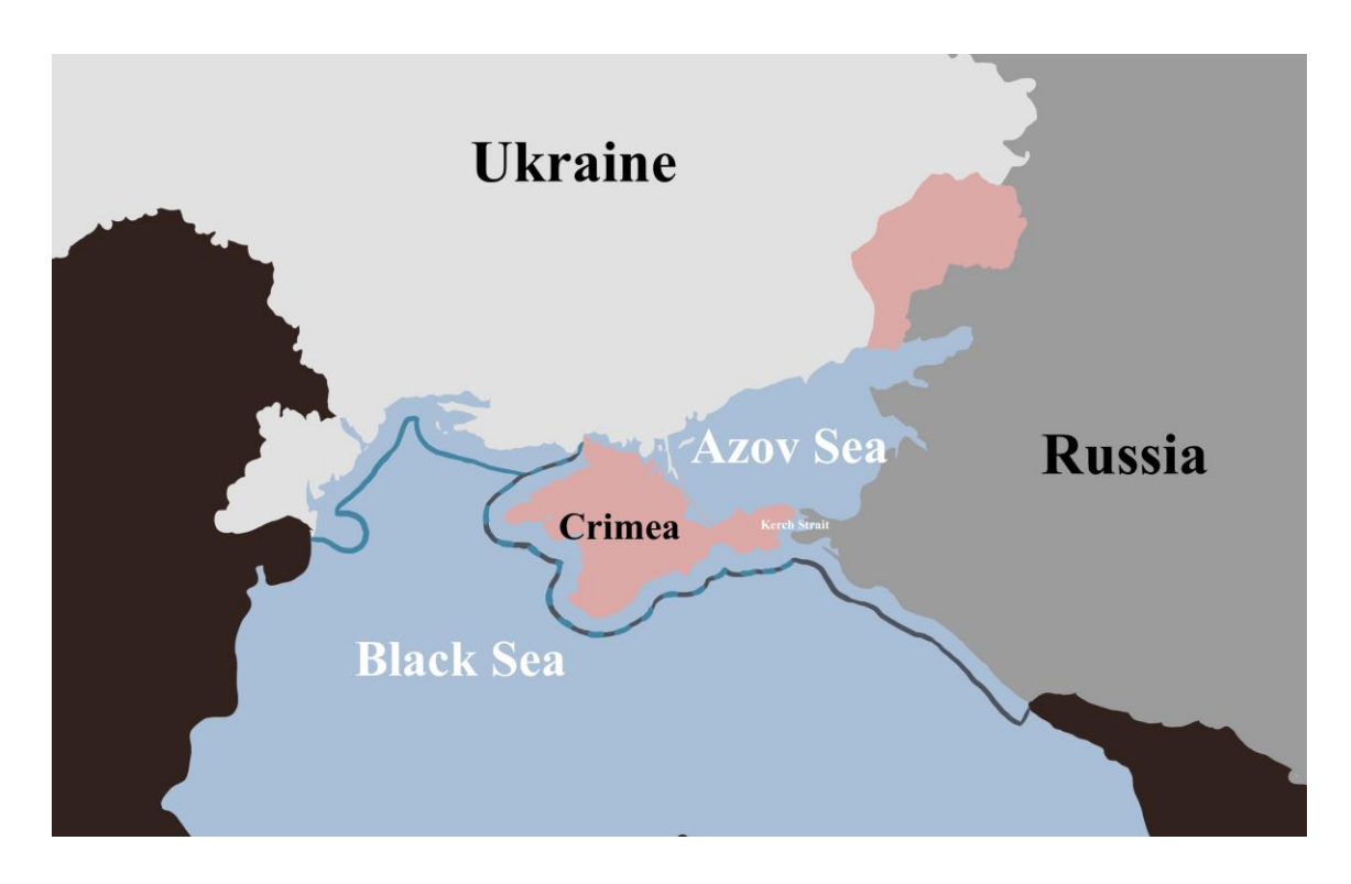
Figure 1 – <u>General map</u>