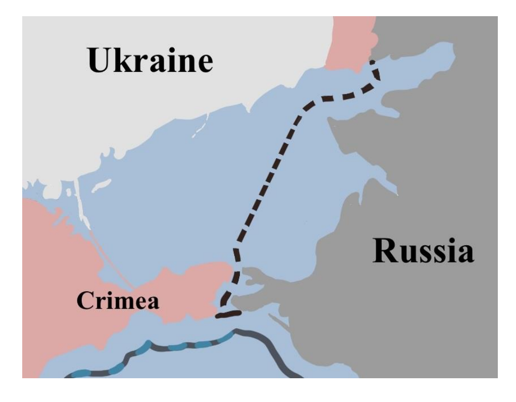
Figure 2 – Azov Sea as internal waters with a hypothetical median line