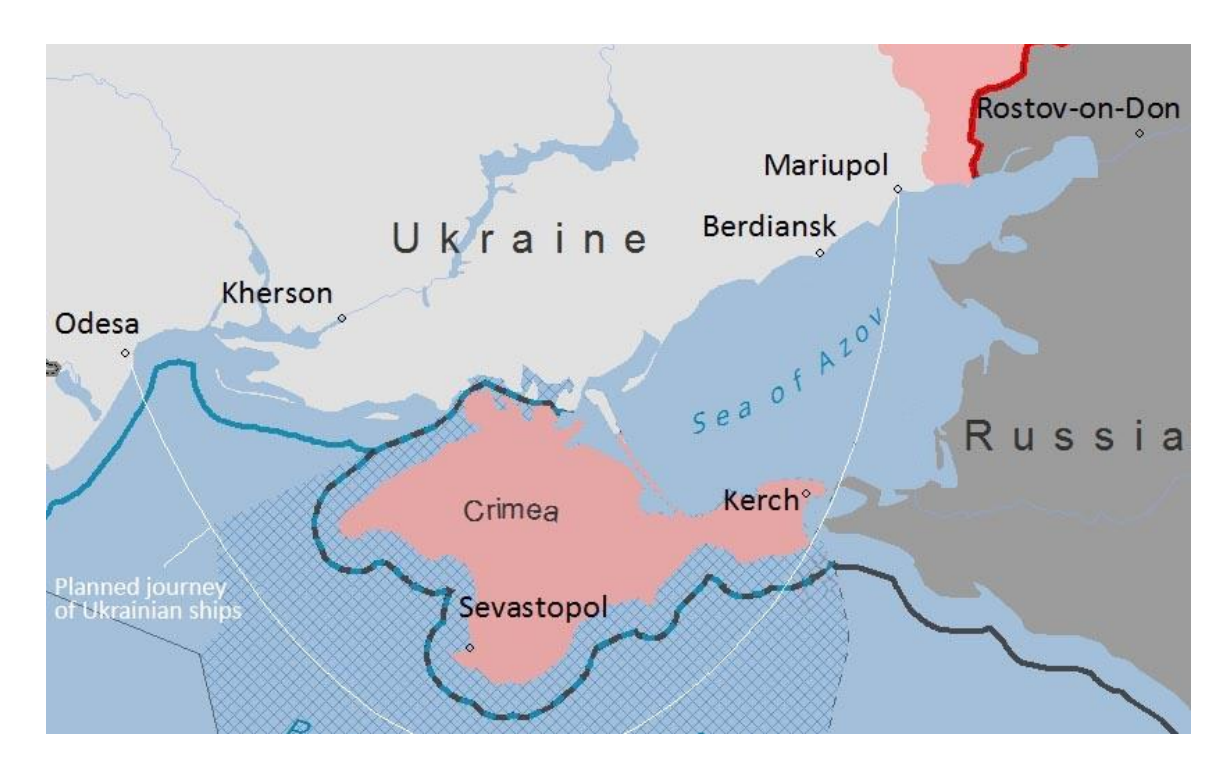
Figure 4 – <u>Planned journey</u><sup>228</sup>