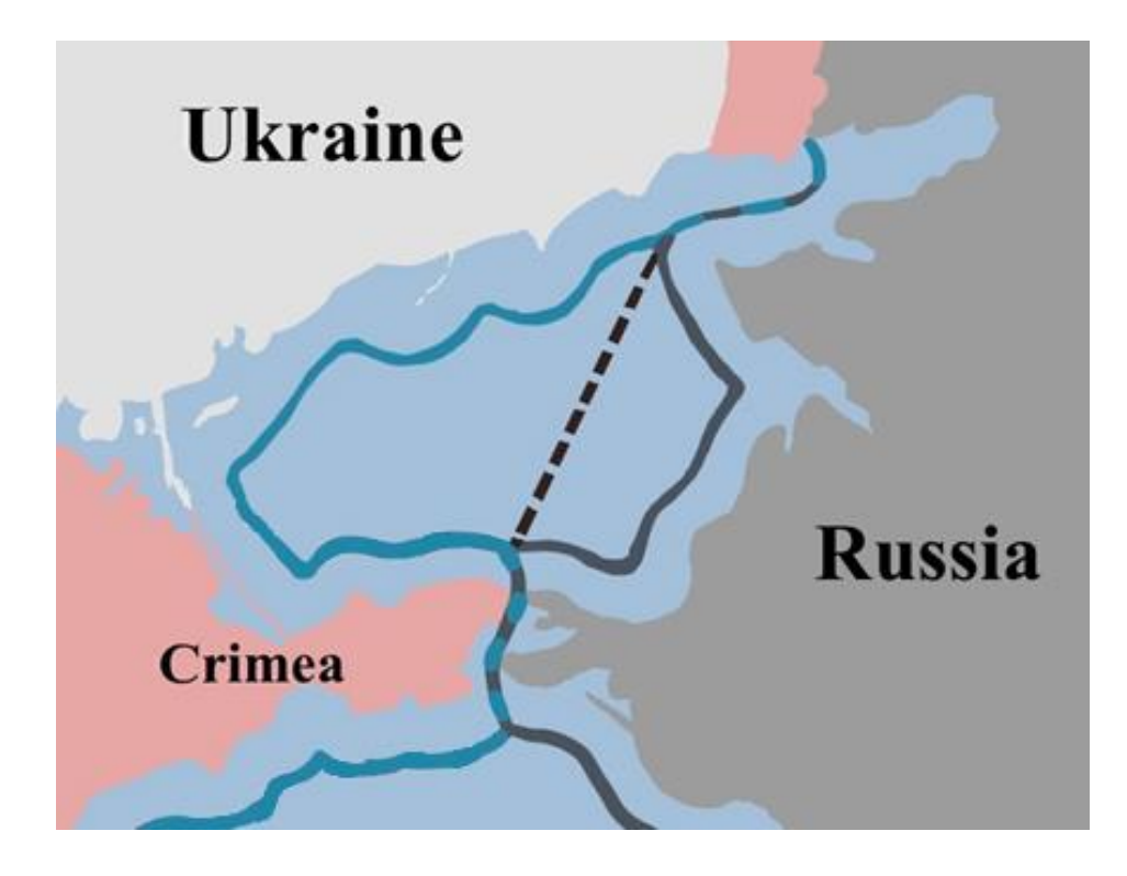
Figure 3 – <u>Hypothetical delimitation of the Azov Sea with normal maritime zones</u>