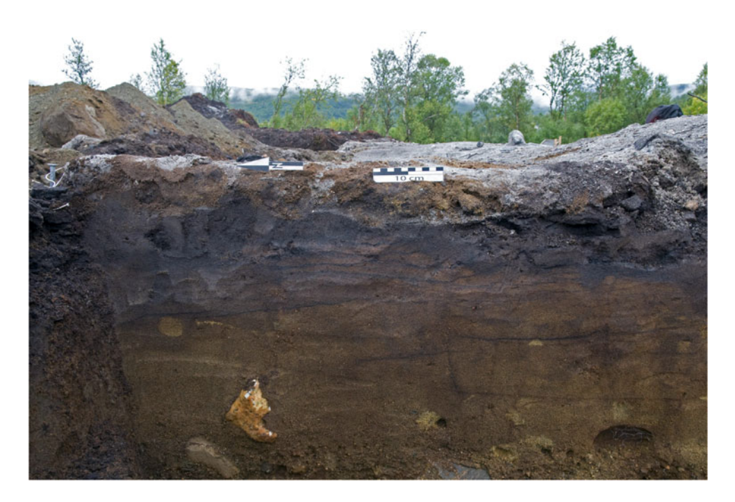
Figure 2. Successive thin charcoal lenses at Tønsnes 10 A15536, Troms, northern Norway.

(Skandfer, 2010: 140). It seems likely that this was a location for pyrotechnological activity rather than a refuse pit. At Mohalsen II (no. 15 on Figure 1 and Table S1) in the southernmost part of the northern region, two separate fireplaces were identified: they consisted of a concentration of potato-sized pebbles in one layer mixed with sooty soil and fragments of charcoal. A little under half of these were fire-cracked.