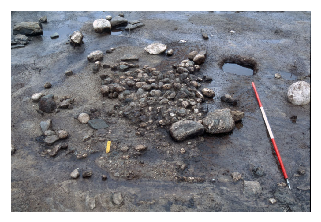
Figure 3. Unit G at Nyhamna 48: concentration of stones sorted by size inside a tent-ring.

concentrations measuring c . 1 m in diameter containing fire-cracked, red-burnt, fist-sized stones (Bang-Andersen, 2015: 85). These features appear to be located on the surface rather than in shallow depressions. Only a few were stone-lined. Some contained small fragments of charcoal consisting predominantly of birch and willow, although remains of oak and pine were also found (Bang-Andersen, 2006, 2015: 87).