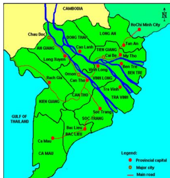
Fig. 1. Selected provinces for the study on adopting Vietnamese good agricultural practices; Ben Tre and Soc Trang (circled), in the Mekong Delta region (Adapted from: Vietnam Institute of Economics and Planning, 2015).

A household survey was conducted in the MD provinces known for small-scale monoculture shrimp farming (General Statistics Organisation, 2021). The Mekong River that crosses the lower basin of MD is divided into two main rivers, Tien River and Hau River, separating the area into two regions. The first region includes six provinces, i.e., Long An, Dong Thap, Vinh Long, Tien Giang, Ben Tre and Tra Vinh (Fig. 1), of which Ben Tre ranks high in shrimp production by volume and value (72,090 MT of shrimp in 2019) (General Statistics Organisation, 2021).