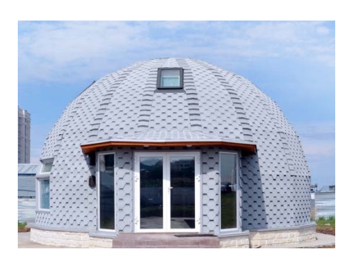
Figure 1. Energy efficient "Yurt" building

Passive house design in the case of the "Yurt" building emphasizes harnessing energy from renewable sources. This is also done by optimizing the building design in a way that maximum solar radiation can be used to heat the building, wind to cool the buildings, vegetation to create shadow, and the temperature of the ground to heat and cool the building via a geothermal pump. It is reported that passive design measures allowed the "Yurt" building to perform 3.5 times energy-wise compared to buildings designed and built according to conventional standards [21]. One of the key building design elements that are deemed to create a passive house effect is the shape of the "Yurt" building's roof which is made in the form of a dome. It is reported to be efficient against winds and snow loads, minimizes heat losses, and requires fewer materials and labor to build. It was reported that yurt-shaped buildings use 23-27 percent less energy during exploitation [21]. The main design specifications are presented in Table 1.