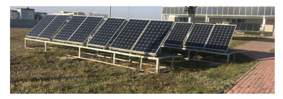
Figure 2. PV solar panels connected to the "Yurt" building