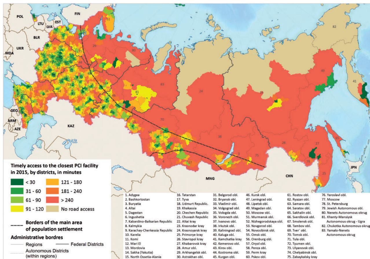
Figure 2. Driving times to the closest PCI facility in Russia in 2015.

The results shown so far have estimated travel times to the nearest PCI facility regardless of which region it was in. However, the financing and delivery of health care are largely devolved to the regions, so patients will normally be treated in the region in which they reside. For some people, the obligation to be treated in their home region might increase travel times compared with going to a facility that is closer but in another region. Consequently, we undertook a sensitivity analysis to compare differences in travel times to the nearest PCI facility in the same region or to the nearest facility wherever it is. This showed that, in 2015, 7 441 200 people or 11% of the population aged 40+ years lived in 400 bordering districts where it would be faster to go to neighbouring regions for treatment. For another 231 500 people who lived in 15 districts, PCI facilities are located only in neighbouring regions (Supplementary Figure 3, available as Supplementary data at IJE online). However, this option is associated with a relatively small increase of about 0.5% (337 690 people) in those who would live within 60 minutes' travel time and 2.3% (1 456 130 people) within 120 minutes' travel time.