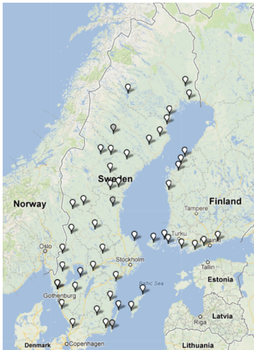
Map 2: Particle following reflexive (sätta sig)

(#1425: Han blev trött, så han satte sig ner. 'He got tired, so he sat down.')