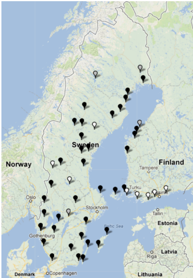
Map 3: Particle preceding reflexive (vända sig) (#1426: Kan du vända om dig och titta hit? 'Can you turn around and look here, please?') (White = high score, grey = medium score, black = low score)