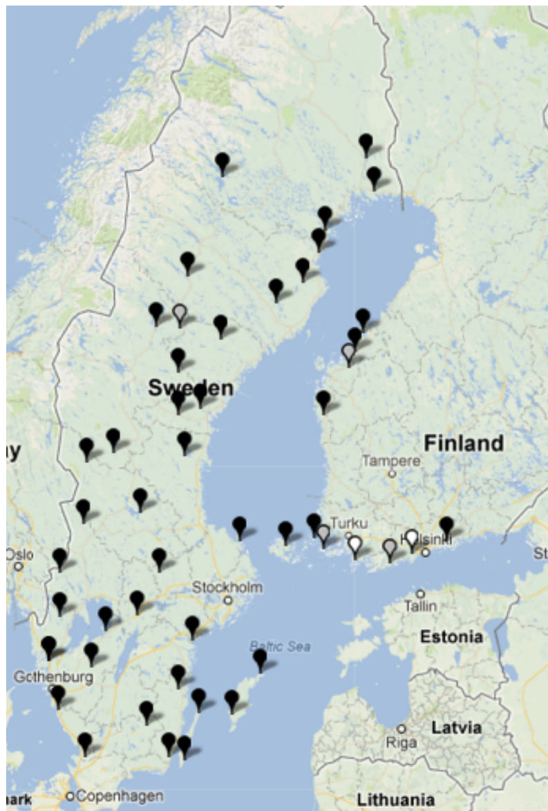
Map 7: Particle following direct object pronoun, older speakers (#1423: Jag satte den på. 'I turned it on.')

(White = high score, grey = medium score, black = low score)