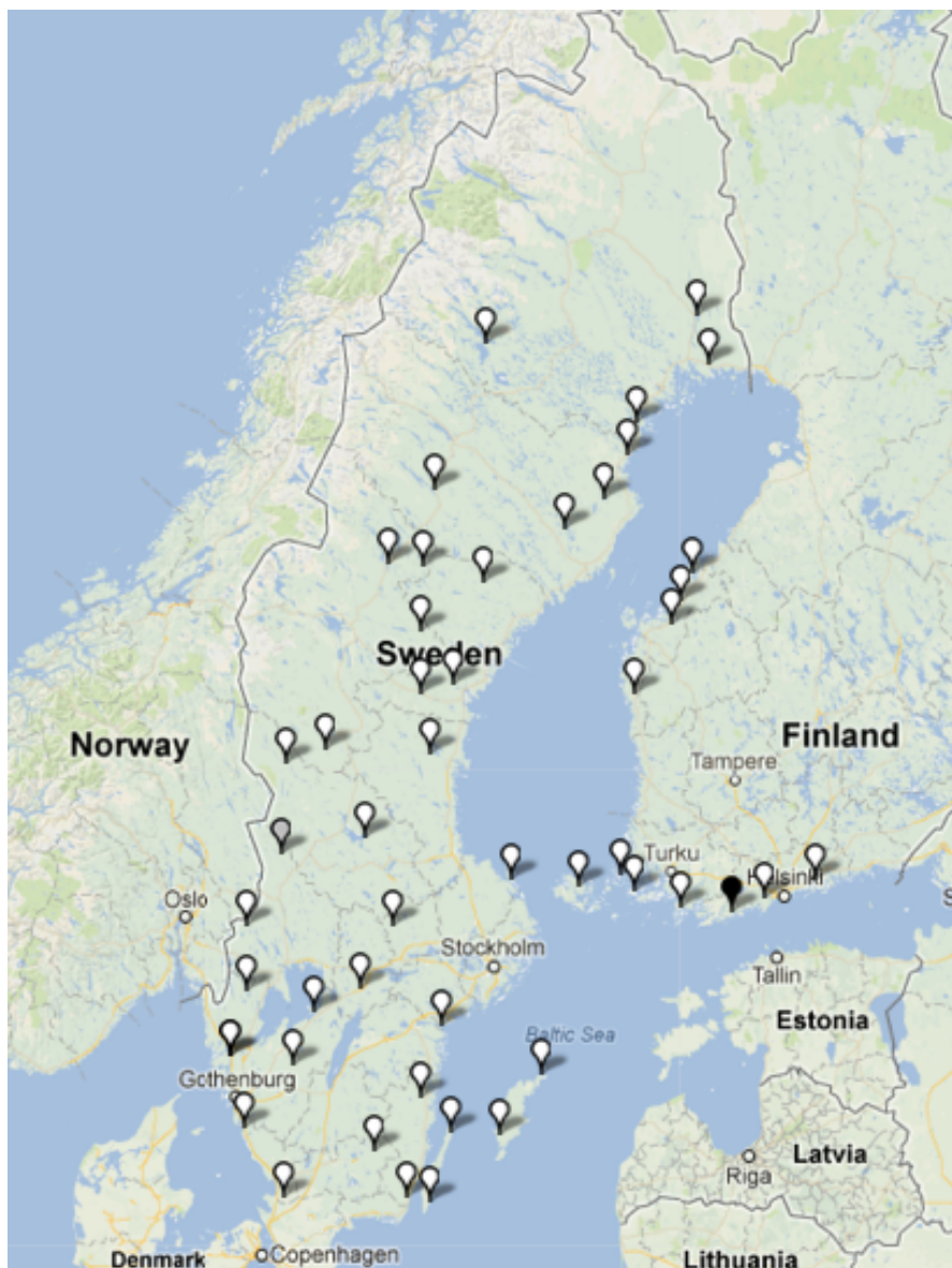
Map 4: Particle following reflexive (vända sig) (#1427: Kan du vända dig om og titta hit? 'Can you turn (yourself) around and look here, please?') (White = high score, grey = medium score, black = low score)