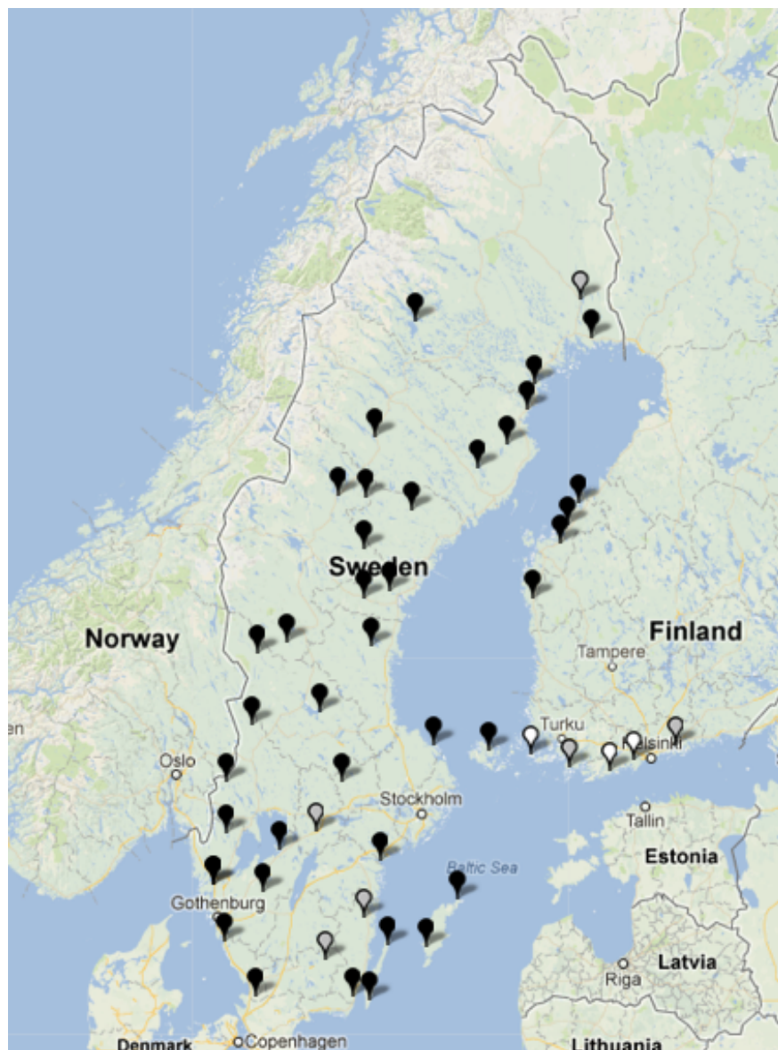
Map 1: Particle preceding reflexive (sätta sig) (#1424: Han blev trött, så han satte ner sig. 'He got tired, so he sat down.' ) (White = high score, grey = medium score, black = low score)

The standard order for this particle verbis the one in (3), i.e., with the particle following the reflexive. As we see in the maps below, the non-standard order is rejected everywhere except for southern Finland (Nyland and Åboland):