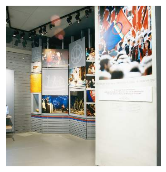
Fig. 6b. Johansen's photo as it is displayed in the exhibition Sápmi – en nasjon blir til.