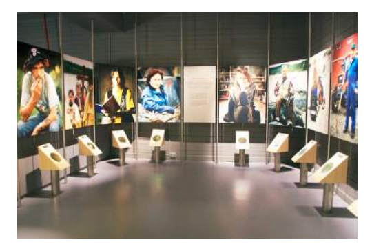
Fig. 5. The exhibition Sápmi – en nasjon blir til: The introduction room and the portraits.

One of the most iconic moments in the exhibition is the final room where on display is the Constitution paragraph 110a (1988), leading to the establishment of a Sámi Parliament in 1989. This celebratory closing of Sápmi – en nasjon blir til usually fascinates even the most reluctant visitors because it celebrates the adhesion of legal protection for the Sámi people – a people who shall thrive