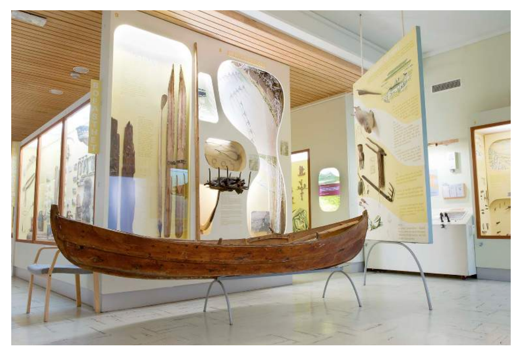
Fig. 4. River Sámi displays in Samekulturen, set-up by Iver Jåks.

the democratization of interaction within museums evolve rapidly from what was called New Museology (Vergo 1989).4 This approach stresses the importance of community participation in the construction of museum representation and interpretations of meanings (Kreps 1998:13). Museological politics of knowledge in the last two decades have modified the role and authority of experts, collaborating with the producers of "authorized" knowledge. On the one hand, this process led to widening intercultural relationships from those established solely around collecting and displaying, to include related issues of restitution, cultural management, and the museum's wider political integrations (Shelton 2006:77). On the other