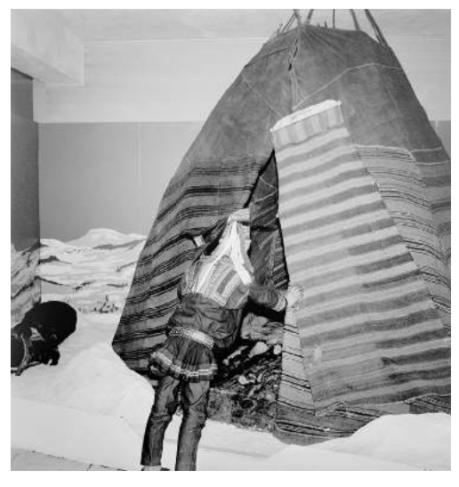
Fig. 1. Exhibition Samekulturen, 1972. A primary school class from Máze visits the exhibition.

When the Sápmi - en Nasjon blir til (Sápmi -Becoming a Nation) exhibition opened at Tromsø University Museum in 2000, it distinguished itself from its predecessor in terms of set-up, plot, and communication strategies, but also performative aspirations. The theme of the exhibition was the narrative of contemporary events that, from World War II to the present, made possible the emergence of the Sámi nation. The original idea for the exhibition was conceived by anthropologist Harald Eidheim (1925-2012), who had been professor at the University of Tromsø and Oslo, and was part of the processual turn in anthropology, in conversation with Frederic Barth and Robert Paine. Eidheim was at the time visiting professor at the Sámi Ethnographic Unit of the museum. The curators1 chose a set-up where the visitors could interact with some of the devices, "gaining insight into how museum presentations can be seen as a dialogue - or negotiation - with audience" (Eidheim et al. 2012:107).