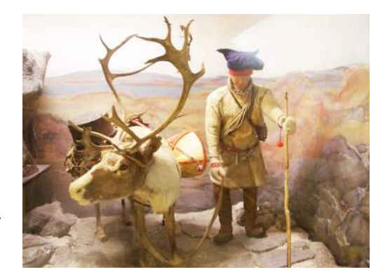
Fig. 3. One of the dioramas in Samekulturen showing the relation between the Sámi people and the reindeer.

The tone of the exhibition is explanatory, the content is presented to an audience basically not informed enough, and which seems not to have been involved in the production of meaning (Hooper-Greenhill, 2003). In the first glass case of the exhibition, a series of historical references, maps, and documents synthetize the beginning of the first chapter of Manker & Vorren's book (1957), revealing how the