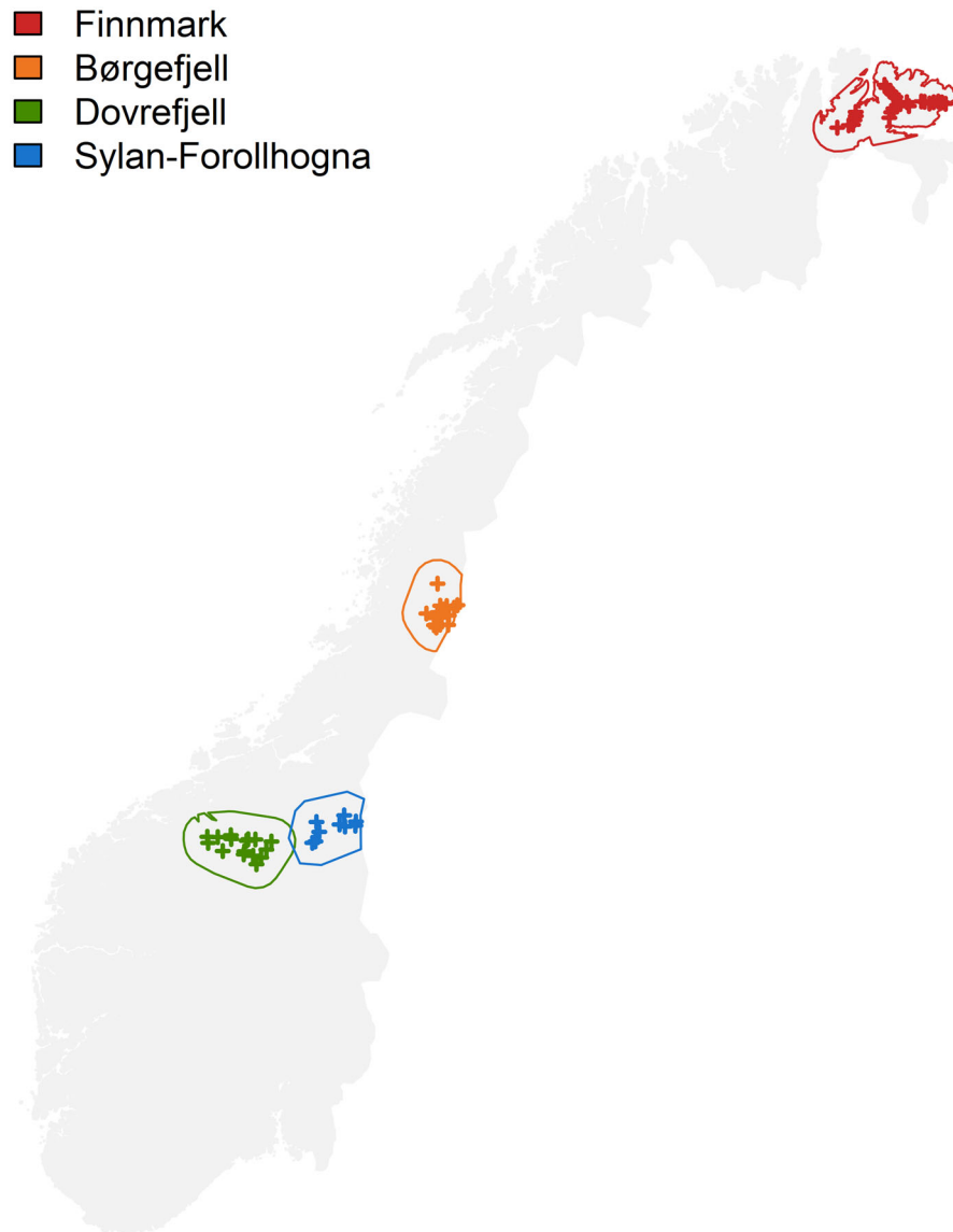
FIGURE 1 Map of the location of cameras used to estimate occupancy and population size of golden eagles. Coloured polygons indicate the outermost buffer line used to estimate territory density and crosses indicate camera placement

970 to 3200 km 2 (Table 1). Each camera trap consisted of a camera (RECONYX HyperFire Professional P800 IR) positioned half a meter above ground and 5 m from a 15–20 kg frozen reindeer offal block. Blocks were replaced non-systematically between two and four times during each survey period depending on the site. Pictures of the offal blocks were taken at 10-min intervals. Poor quality images occurred due to adverse weather or snow covering the lens and only days with a minimum of 50 good quality pictures were included in analyses.