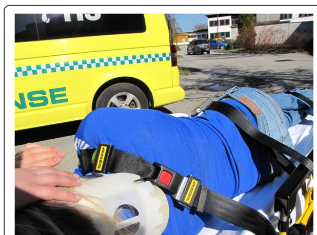
Figure 1 The lateral trauma position. A patient has been positioned in the lateral trauma position on a stretcher. Observe that the most cephalic stretcher belt has been placed above the shoulder to prevent forward movement on the stretcher.

After checking airways and breathing, the unconscious trauma patient is carefully rolled to a lateral recovery position, maintaining manual in-line stabilization with the c-collar in place (see Table 1 and Figure 1). The method was described in the EMS protocols, a teaching video was made, and training and retraining was instituted locally. PHTLS Norway has adopted LTP in their educational program (Sindre Mellesmo, personal communication). In addition to being demonstrated in PHTLS courses, LTP is now part of the written protocols in some Norwegian EMS and is described in the