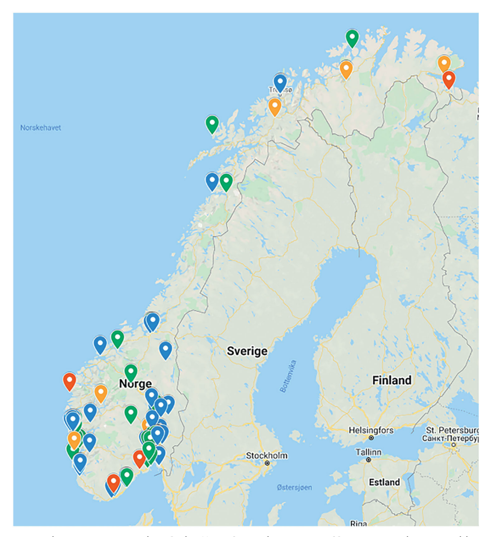
Figure 2. The 92 general practices recruited to PraksisNett. Green denotes 2-4 GPs per general practice, blue 5-7 GPs, yellow 8-10 GPs and red > 10 GPs (map from google.com/maps).

also compared to many international PBRNs, as PraksisNett will have the IT infrastructure necessary to plan studies, identify and invite patients and monitor routine and clinical data for studies in primary care. This is a novel and innovative part of PraksisNett but also the part that has demanded most resources and caused delays in the establishment of the infrastructure. Especially, the collaboration with many different EHR vendors, changes in EHR hosting from local servers to web-based servers and the introduction of GDPR have so far caused several time-consuming delays and adjustments during the establishment period.