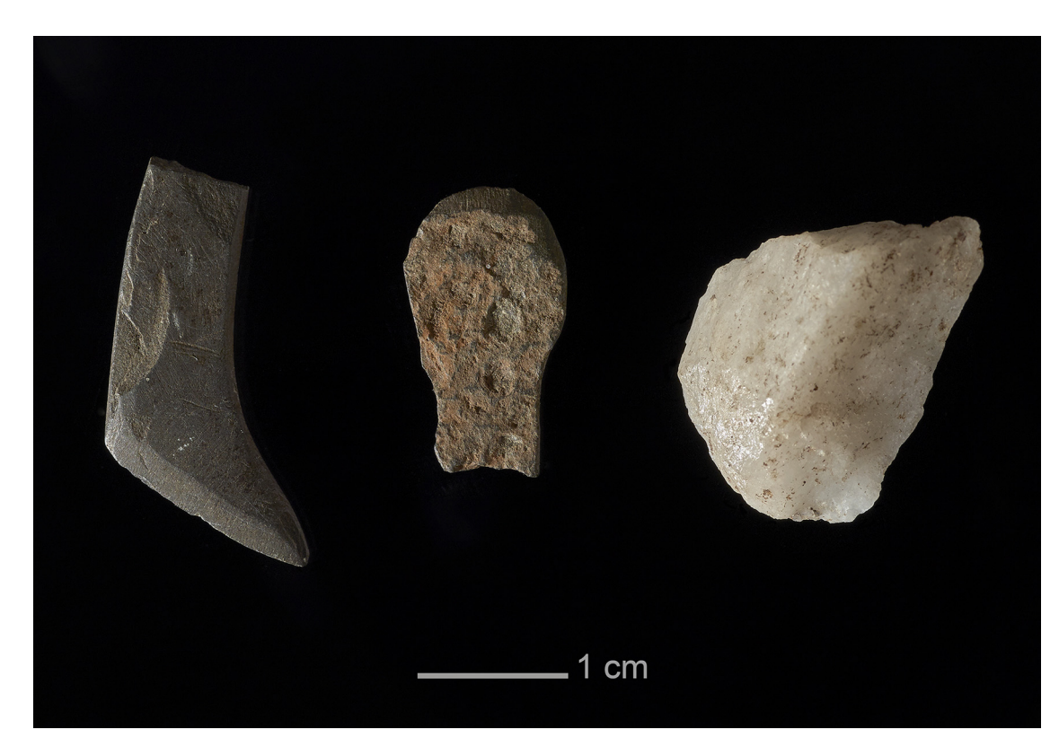
Figure 4: A "miniature" slate knife and two lithic scrapers, one atypical spoon-shaped in slate and one in coarse quartz, all from Rissebávti/Gressbakken Nedre Vest house 4.