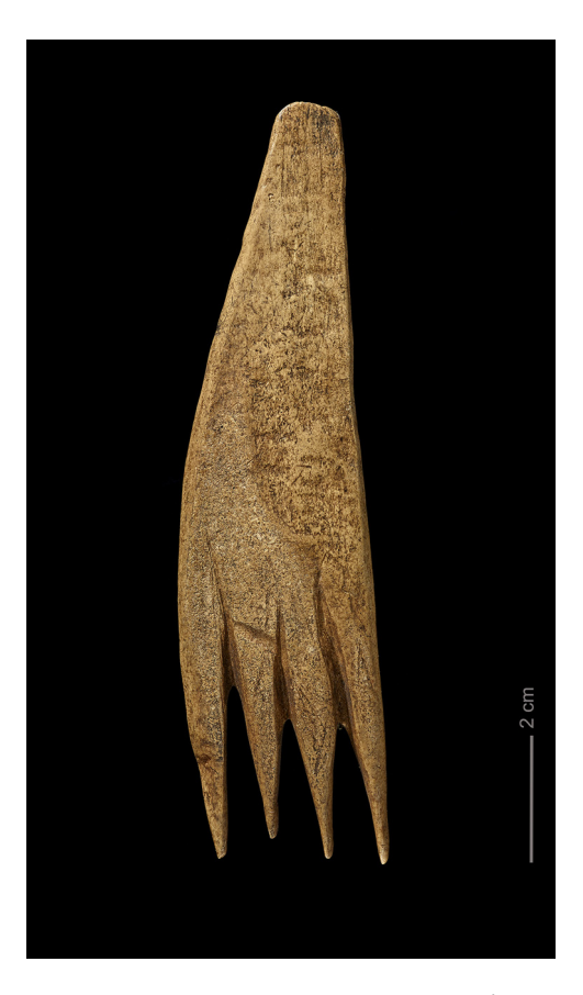
Figure 7: Bone comb, possibly used to split sinew into thin thread, from Rissebávti/Gressbakken Nedre Vest house 4.

animals in Stone Age Norway. Human-animal relational ontologies are therefore a relevant social concern for investigating hide processing.