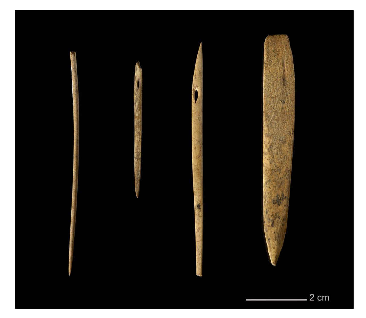
Figure 6: Bone sewing needles with perforated holes and a bone awl, all from Rissebávti/Gressbakken Nedre Vest house 4.

Northern Mesolithic communities not only had few alternatives to hide and fur to make things vital for their survival, particularly for clothes and footwear, but also for boat and tent covers, other types of sheltering and containers, snares, nets and fishing lines, and for a variety of other practical purposes. In archaeology, the role of hide, skin, and fur-bearing animals in Stone Age hunter-gatherer communities is – if addressed – typically explained in general economic terms and understood from the perspective of human practical needs and human hide craft technologies to fulfil these. The practical significance of hide products is hardly addressed in Norwegian Stone Age research but may lie implicit in sporadic notions in excavation reports and publications of the importance of different resources provided particularly by large ungulates, beaver, and otter.