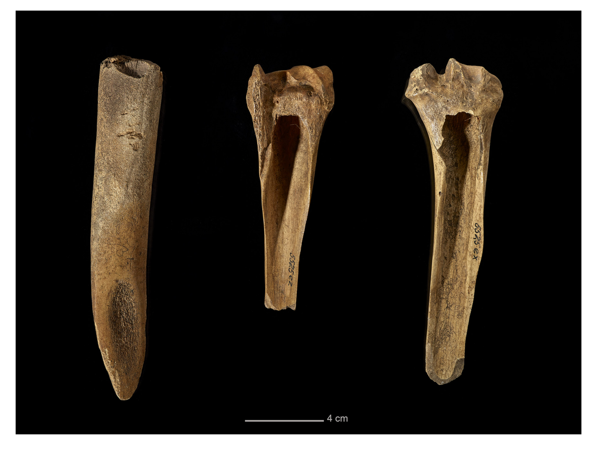
Figure 5: A bone-end-scraper from Rissebávti/Gressbakken Nedre Vest house 4 and two side-scrapers from house 3, all with heavy wear-marks and made of reindeer long-bone.

bone scrapers and slate knives of various sizes. Preparing different hides and sewing clothes which included fur from various fur-bearing animals seems to have been a major activity, and seemingly, the whole chain of hide work activities, from the initial flensing of animals to the finishing of items took place here. A high number of awls in combination with sewing needles may also be the case for Kotedalen, but here fragmentation is so high that only approximately 50% of all bone tools are classified, and needles and awls are not functionally divided (Olsen, 1992, p. 160). The variety of fur-bearing animals identified, and the particularly high proportion of otter remains may suggest that among other activities, sewing of new hide and fur items took place. At Vistehola and Storbåthallaren, large numbers of awls are found together with only one or two needles. However, given that the osseous materials from both includes several fur-bearing and even non-local animals, it cannot be ruled out that here also sewing was one of the (main) seasonal activities.