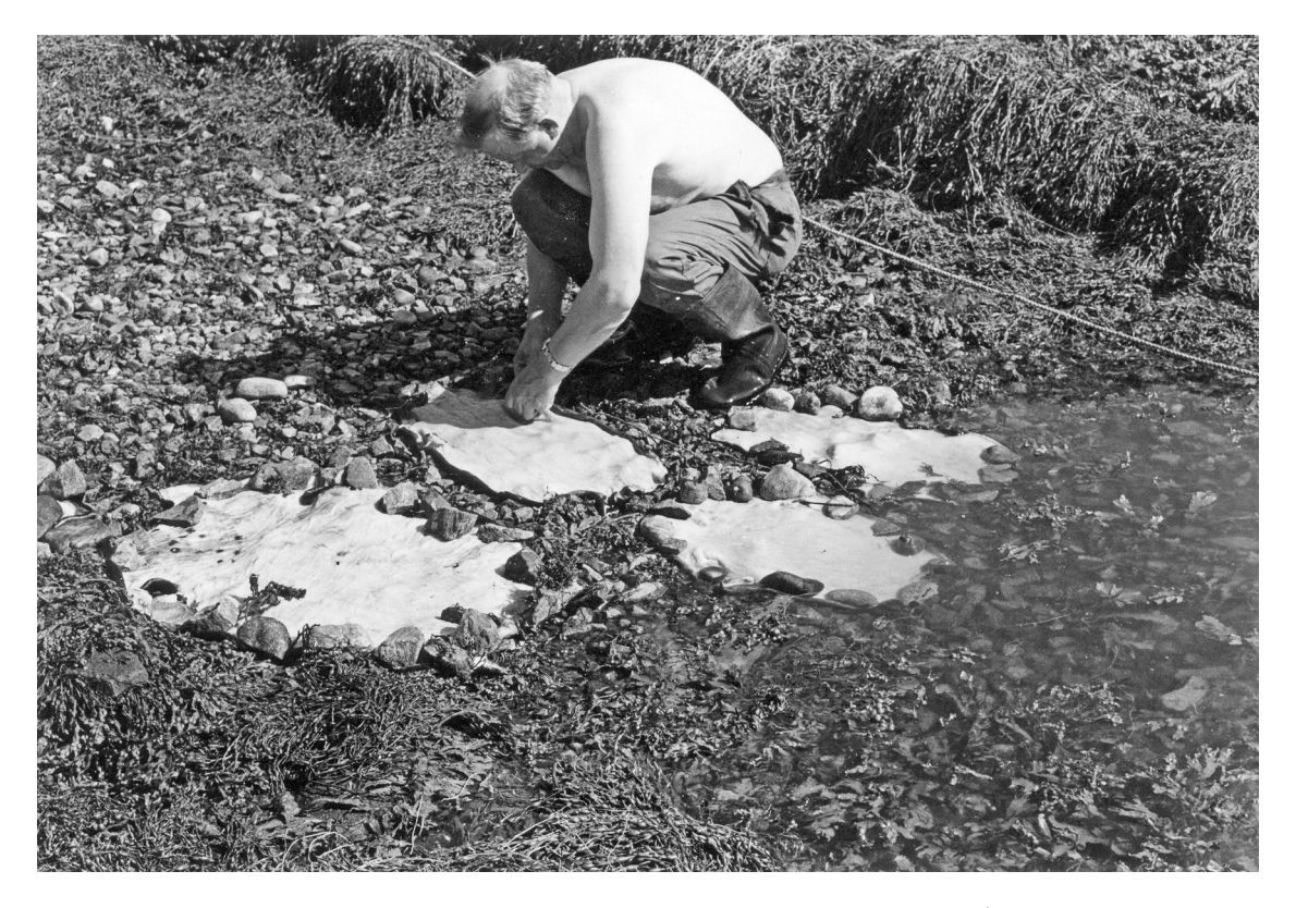
Figure 1: Habour seal ( Phoca vitulina ) hides stretched out and soaked in the tidal water zone, Måsvær, North Norway, in 1972. Harbour seal hides vary considerably in colour and pattern. Traditional hide processing documented by H. D. Bratrein, UIT – The Arctic University of Norway.

Fat and smoke tanning are considered the oldest chemical tanning methods (Nesheim, 1964, pp. 201, 208; Rahme, 2010, p. 33), fat tanning being the most common among northern hunter-gatherers and particularly well-suited for tanning pelts. Fat tanning adds additional softness, water-resistance, and durability to the hide. It is suitable for skins from a variety of animals, such as seal, reindeer, elk/moose,