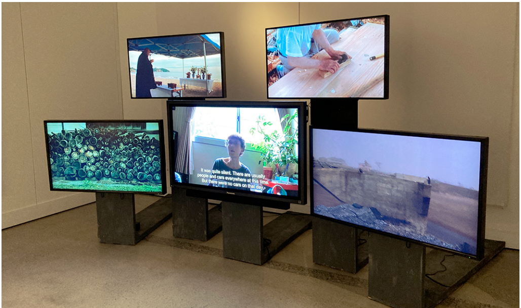
Fig. 5. Selected videos from The Center for Remembering 3.11 , on view at A Future for Memory at MOA, 2021.

2013). In fact, as heritage, with its transformed materiality of debris and intangible patrimony of multiple unexplored narratives, 3.11 is a complex social field; it requires a systemic approach to its complexity. Since it opened, A Future for Memory has elicited great interest not only within North America and Japan, but internationally. Because the Covid-19 pandemic made it difficult to run the exhibition in the usual way, a series of virtual programs made possible for hundreds of visitors to fully participate in the exhibition online, interacting and learning through their screen. Thanks to regular webinars and guided virtual tours, people in North America, Australia, Europe and Asia have also attended the events curated by Nakamura, marking the realization of an arena for transnational museology. The conversations