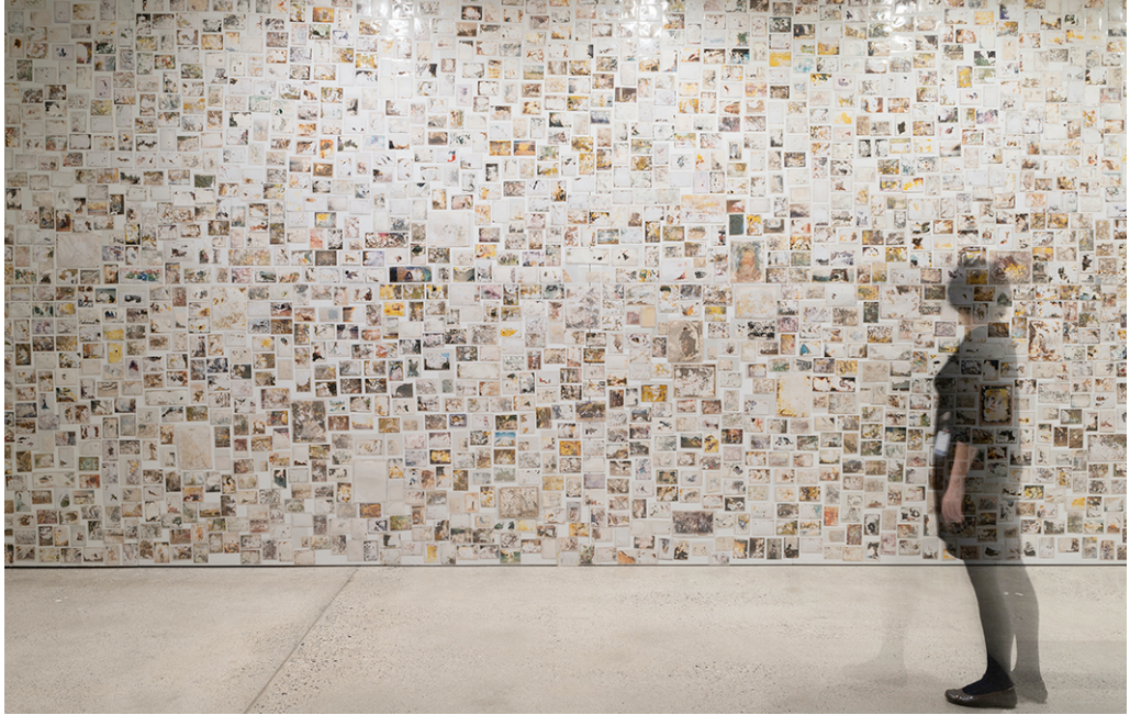
Fig. 9. Rescued, damaged photos found in Yamamoto-chō in Watari District, Miyagi Prefecture at A Future for Memory at MOA, 2021.

guests invited to take part in something that would have taken place with or without them. Popular expressivity was elicited by the extreme situation, but also through temporary arrangements protracted over years. Creativity became a mode of critical response to governmental measures that often overlooked needs of survivors.