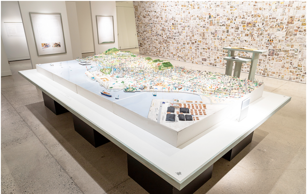
Fig. 3. The scale model of Ōfunato City, Iwate Prefecture by Lost Homes Scale Model Restoration Project at A Future for Memory, 2021. Courtesy of General Incorporated Association Tonarino. Photo by Alina Ilyasova. Courtesy of the Museum of Anthropology, University of British Columbia.

A Future for Memory builds on “critical museology”, an area in which MOA has been a pioneer for more than two decades (Shelton