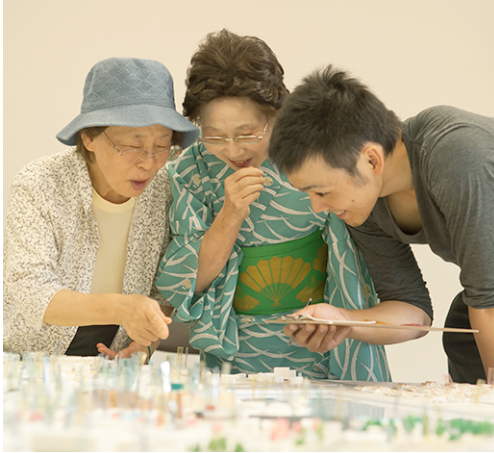
Fig. 4. “Town of Memory” workshop in Ōfunato City, Iwate Prefecture, August 2013.

2013). In fact, as heritage, with its transformed materiality of debris and intangible patrimony of multiple unexplored narratives, 3.11 is a complex social field; it requires a systemic approach to its complexity. Since it opened, A Future for Memory has elicited great interest not only within North America and Japan, but internationally. Because the Covid-19 pandemic made it difficult to run the exhibition in the usual way, a series of virtual programs made possible for hundreds of visitors to fully participate in the exhibition online, interacting and learning through their screen. Thanks to regular webinars and guided virtual tours, people in North America, Australia, Europe and Asia have also attended the events curated by Nakamura, marking the realization of an arena for transnational museology. The conversations