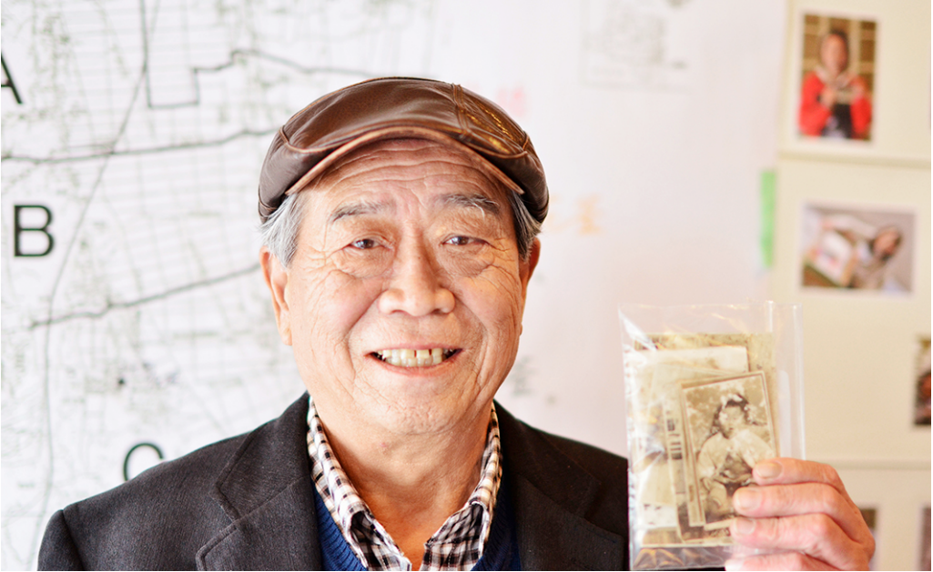
Fig. 8. A photo rescued and cleaned by the Omoide Salvage Project in Yamamoto-chō, Watari District, Miyagi Prefecture. He found his photo taken by his father when he was one year old. When he found this photo, he said, “This photo was taken 71 years ago, and today is my birthday.”

of these proportions, now had the privilege of highlighting beauty, resilience, aspiration, sometimes together, sometimes simply on behalf of others. At its heart, the exhibition shows the relational aspects generated between locals and outsiders, whose testimonies are found in the exhibit publication and in videos included in the exhibition and on the MOA website.