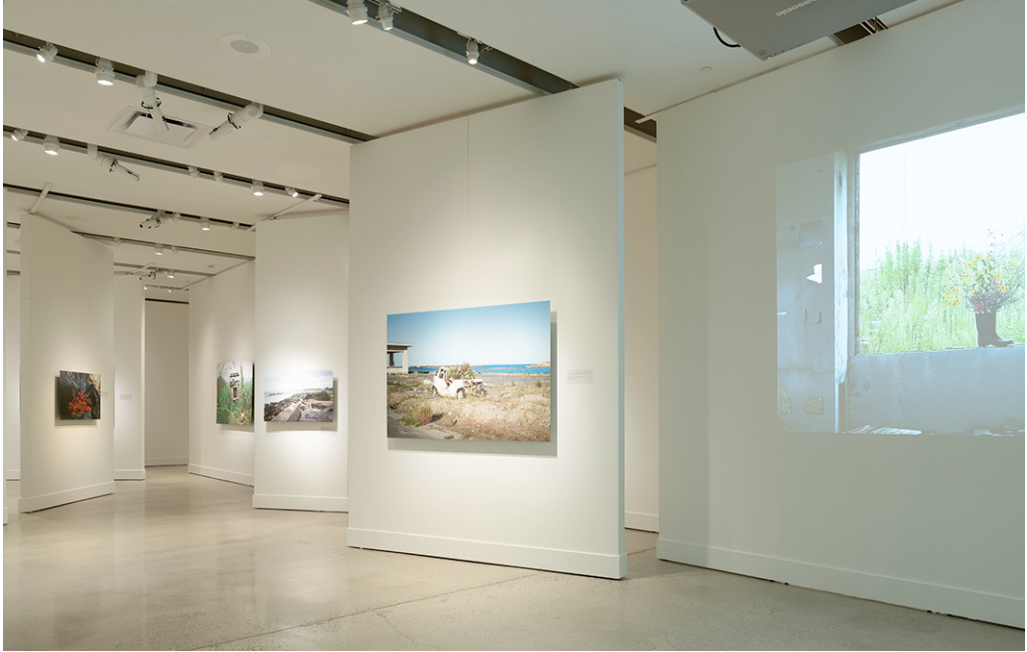
Fig. 10. Atsunobu Katagiri, Sacrifice series (2013–2014) at A Future for Memory at MOA, 2021.

these ancient regional inhabitants were well-aware of the forces of regeneration implied through the gathering of wild food and preparation of it using clay pots. His use of these items today can be read as a suggested reconnection with the values and praxis of an ancient ecological balance between humans and environment, an ability to “bind” – further exemplified by the ropes imprinted on the clay pots. The artist’s ikebana enlivens these archaeological artefacts. Flowers and stems burst with renewed energy leaning on the edges of the archaic vases.