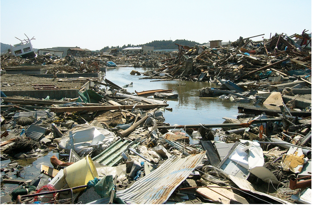
Fig. 2. On April 5, 2011, situation at Nainowaki, Kesennuma City. The water-channel at the center is actually a road. To search for bodies and to remove debris, embankments were made along the main streets, so they began to look like roads. However, once we entered small alleys, most of them were water channels that look like this. This street was the route to and from the work that I used to do. The residential houses I used to see every day were all gone and there was no way to trace back my memory [...]. Photo and text by Hiroyasu Yamauchi.

animals, plants, and crops) in Fukushima and beyond remain largely unknown, and it is hard to come by reliable information on this topic that is neither a government-sanctioned denial of the problem nor sensationalist apocalyptic rhetoric (Rots 2021:3).