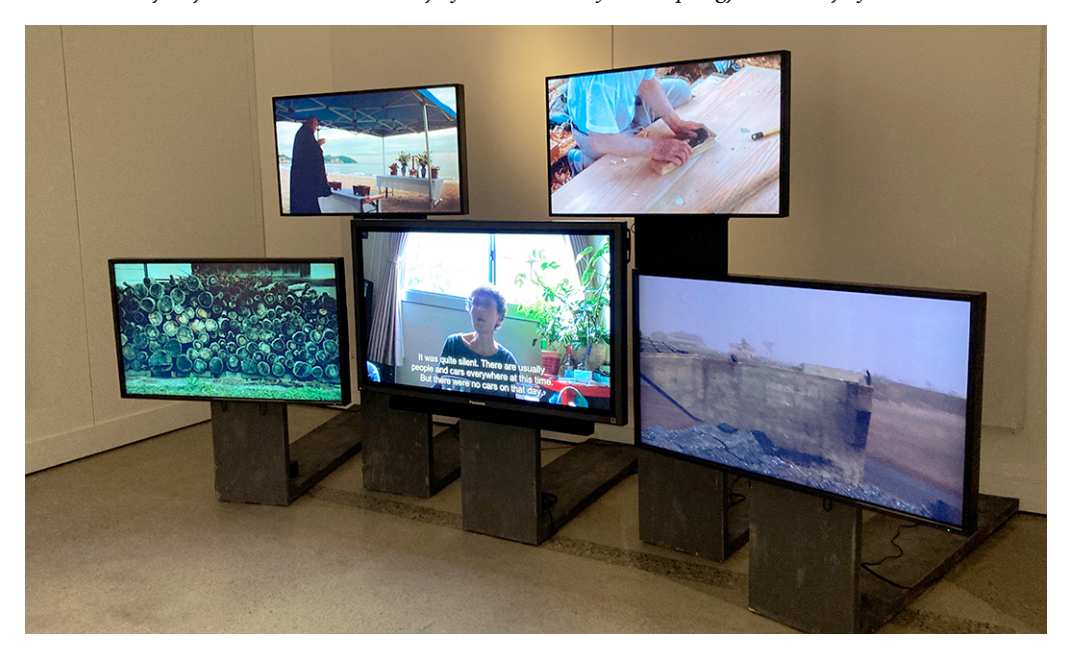
Fig. 5. Selected videos from The Center for Remembering 3.11, on view at A Future for Memory at MOA, 2021.

2013). In fact, as heritage, with its transformed materiality of debris and intangible patrimony of multiple unexplored narratives, 3.11 is a complex social field; it requires a systemic approach to its complexity. Since it opened, A Future for Memory has elicited great interest not only within North America and Japan, but internationally. Because the Covid-19 pandemic made it difficult to run the exhibition in the usual way, a series of virtual programs made possible for hundreds of visitors to fully participate in the exhibition online, interacting and learning through their screen. Thanks to regular webinars and guided virtual tours, people in North America, Australia, Europe and Asia have also attended the events curated by Nakamura, marking the realization of an arena for transnational museology. The conversations