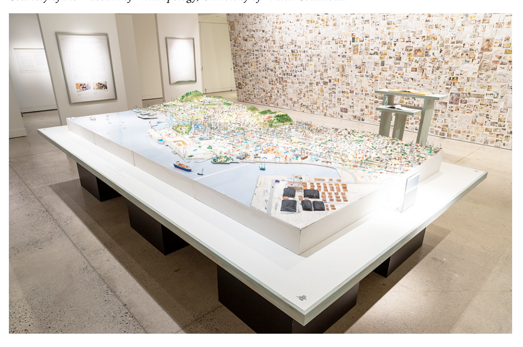
Fig. 3. The scale model of Ōfunato City, Iwate Prefecture by Lost Homes Scale Model Restoration Project at A Future for Memory, 2021. Courtesy of General Incorporated Association Tonarino. Photo by Alina Ilyasova. Courtesy of the Museum of Anthropology, University of British Columbia.

A Future for Memory builds on "critical museology", an area in which MOA has been a pioneer for more than two decades (Shelton