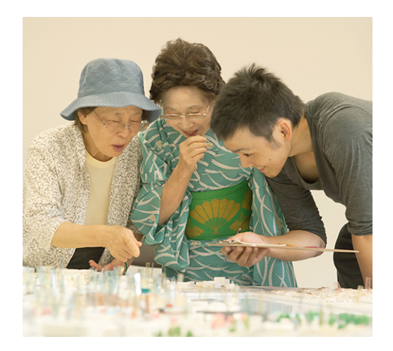
Fig. 4. "Town of Memory" workshop in Ōfunato City, Iwate Prefecture, August 2013.

2013). In fact, as heritage, with its transformed materiality of debris and intangible patrimony of multiple unexplored narratives, 3.11 is a complex social field; it requires a systemic approach to its complexity. Since it opened, A Future for Memory has elicited great interest not only within North America and Japan, but internationally. Because the Covid-19 pandemic made it difficult to run the exhibition in the usual way, a series of virtual programs made possible for hundreds of visitors to fully participate in the exhibition online, interacting and learning through their screen. Thanks to regular webinars and guided virtual tours, people in North America, Australia, Europe and Asia have also attended the events curated by Nakamura, marking the realization of an arena for transnational museology. The conversations