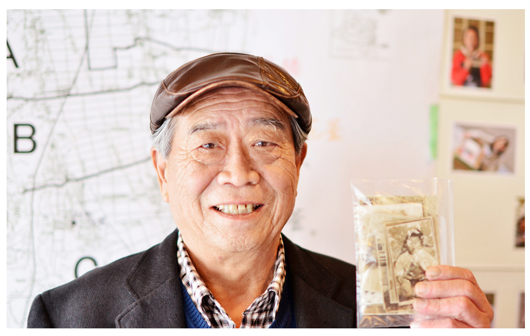
Fig. 8. A photo rescued and cleaned by the Omoide Salvage Project in Yamamoto-chō, Watari District, Miyagi Prefecture. He found his photo taken by his father when he was one year old. When he found this photo, he said, "This photo was taken 71 years ago, and today is my birthday."

of these proportions, now had the privilege of highlighting beauty, resilience, aspiration, sometimes together, sometimes simply on behalf of others. At its heart, the exhibition shows the relational aspects generated between locals and outsiders, whose testimonies are found in the exhibit publication and in videos included in the exhibition and on the MOA website.