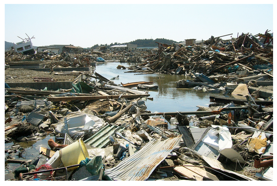
Fig. 2. On April 5, 2011, situation at Nainowaki, Kesennuma City. The water-channel at the center is actually a road. To search for bodies and to remove debris, embankments were made along the main streets, so they began to look like roads. However, once we entered small alleys, most of them were water channels that look like this. This street was the route to and from the work that I used to do. The residential houses I used to see every day were all gone and there was no way to trace back my memory [...]. Photo and text by Hiroyasu Yamauchi.

animals, plants, and crops) in Fukushima and beyond remain largely unknown, and it is hard to come by reliable information on this topic that is neither a government-sanctioned denial of the problem nor sensationalist apocalyptic rhetoric (Rots 2021:3).