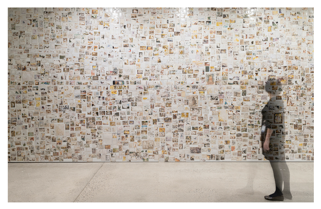
Fig. 9. Rescued, damaged photos found in Yamamoto-chō in Watari District, Miyagi Prefecture at A Future for Memory at MOA, 2021.

guests invited to take part in something that would have taken place with or without them. Popular expressivity was elicited by the extreme situation, but also through temporary arrangements protracted over years. Creativity became a mode of critical response to governmental measures that often overlooked needs of survivors.