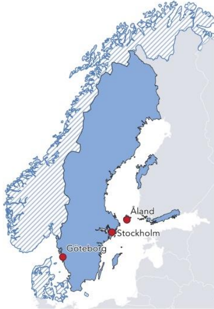
MAP 1: Swedish field work locations: Gothenburg, Stockholm, and Åland (Finland).

Gothenburg, Stockholm, and (to a lesser extent) Åland (Finland); see Map 1. A total of 12,491 Swedish sentences are included in the database, but 3,024 of these target the word order of embedded clauses; these are discussed in Westendorp (2021). 9,467 sentences target the argument placement phenomena discussed in this article, and 4,731 of these carry direct information about the word order patterns discussed in this article; see more below.