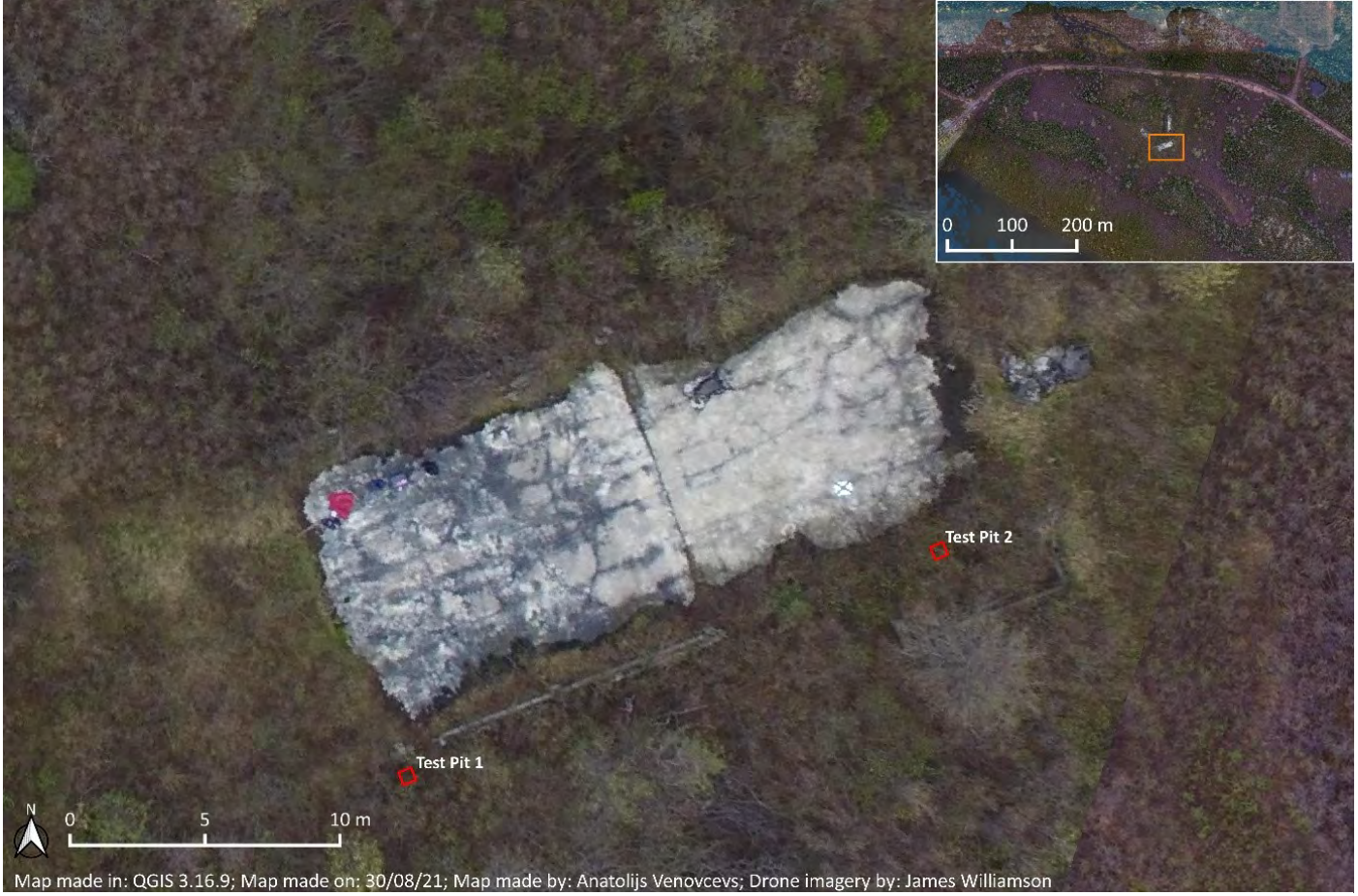
Figure 4: Location of Test Pit 1 and Test Pit 2 by Building 1 – the Recreational Centre (map by Anatolijs Venovcevs, imagery by James Williamson).

Prior to analysis all samples have been dried to constant weight at room temperature, visually described, homogenized, and finally passed through a 1.25 mm sieve. The analytical procedures undertaken were as follows.