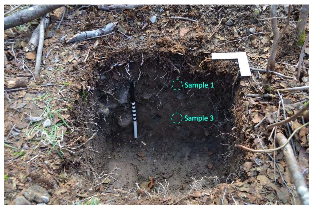
Figure 5: Sample 1 and Sample 3 within Test Pit 1 (figure by Anatolijs Venovcevs).

orbital shaker for 10 min, after the shaking they got to stand still for 20 min to develop colour by molybdenum blue reaction. Phosphate content was determined using a standard solution made up from dihydrogen phosphate and 0.1 M sulphuric acid solution. The readings were done using a spectrophotometer operating at a wavelength of 880 nm. The Olsen method recommends using 5 g of soil, but we only used 1 g, this might give somewhat poorer repeatability.