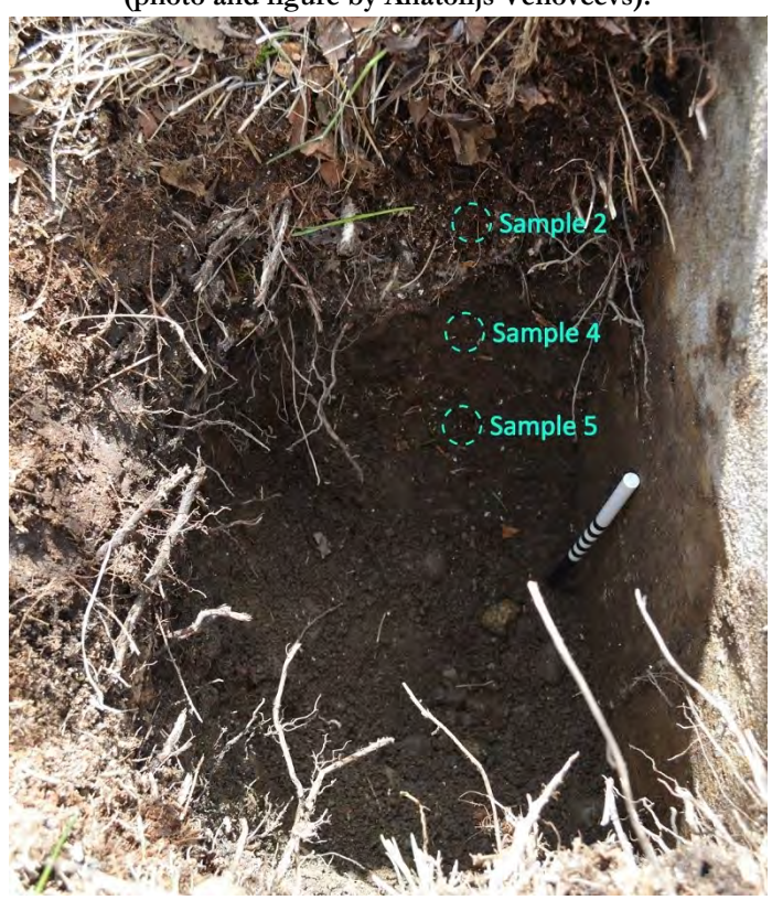
Figure 6: Samples 2, 4, and 5 within Test Pit 2 (photo and figure by Anatolijs Venovcevs).

weight of each sample before and after controlled incineration. This way the total amount of organic carbon (OC) lost under the treatment can be calculated (Reitz and Shackley 2012).