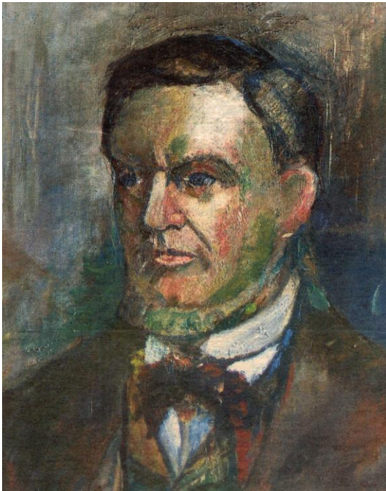
2. A painting of Hauge from Elverhøy church in Tromsø. Hauge visited this church which was built in 1801-1803. The original church building stood on the site of the current cathedral and was later moved to Elverhøy.