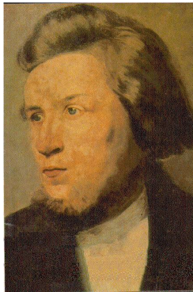
Hans Nielsen Hauge. The only known original portrait of the preacher, thought to have been painted during a visit to Copenhagen in 1800.