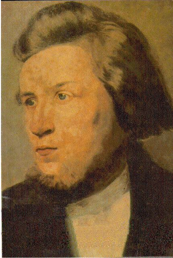
1. The only know original portrait of Hauge, thought to have been painted in Copenhagen in 1800.